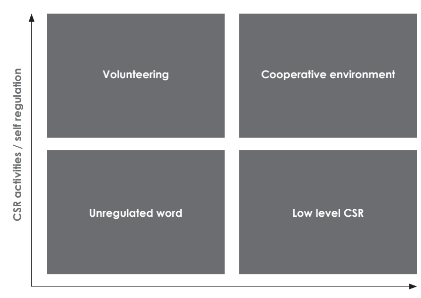
Figure 1. Regulatory Environment for Industry's CSR Activities

As far as legislation if concerned, a low level signifies an undervalued and under-regulated legislative environment. In this case, the safety issues do not appear as necessities for either the regulator or political decision makers. This is illustrated by Palfrey's first phase of the development of the internet when until the end of the 1990s online activities were below the radar of the state (Palfrey 2010). In 1998, the Children's Online Privacy Protection Act in the United States marked the end of this period. Palfrey's second "access denied" period began when states and governments started to think about online activities as something that needed to be blocked or heavily managed. It was a paradigm shift in legislation on children's online safety. Therefore, a high level of legislation signifies that both regulators and political decision makers are sensitive to online safety.