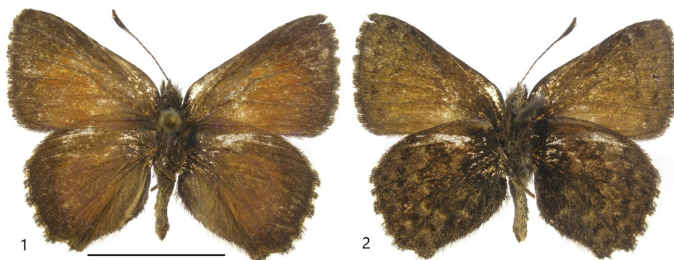
Figures 1–2. Penaincisalia alina sp. nov. Holotype. 1 = recto; 2 = idem, verso. The violet sheen of the dorsal wingsurfaces was not caught by the camera because of the light conditions (for colour reflection see Figs. 8–9) (scale: 10 mm).