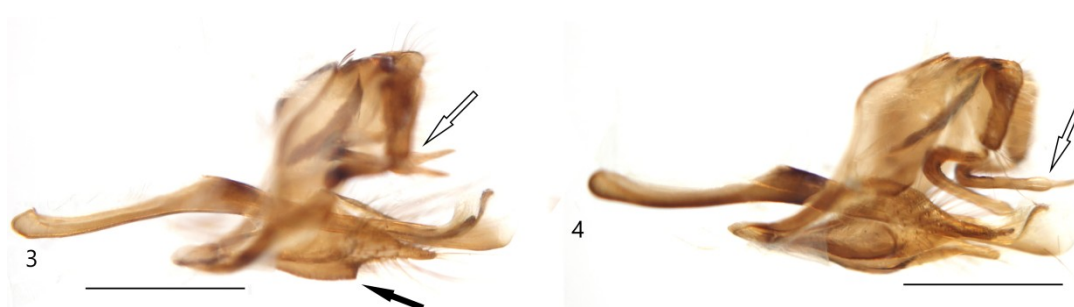
Figures 3–4. Male Penaincisalia genitalia capsule and aedeagus in dorsal view, in same magnification. 3 = P. alina sp. nov. (holotype; Bálint gen. prep. no. 1659) (a black arrow indicates the genitalia character of P. alina ; white arrows point to gnathos before the pointed terminus, what showing a character state to be the supposed apomorphy of Penaincisalia s. str.) 4 = P. aurulenta K. Johnson, 1990 (Peru, Llanganuco; Bálint gen. prep. no. 1660) (scale bars = 0.8 mm).