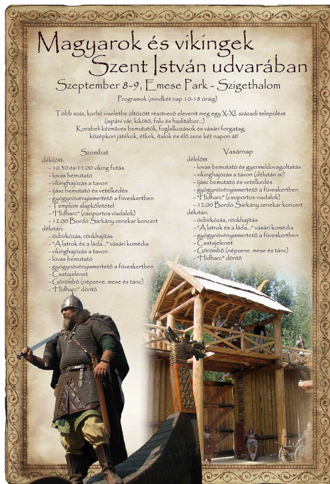
Fig. 1. Re-enactment poster advertising the event 'Hungarians and Vikings in Saint Stephen's court'.

The two mentioned boats (7 and 11 meters long) participated in a smaller experiment when tested on a tour along the Csepel Island on the Danube in 2017. The boat tour lasted three days and completed 120km on the river, half of which was taken in headwind and upstream. The experiment, however, was testing the crews' capacity and equipment rather than any scientific theories. Although the smaller Viking ship was