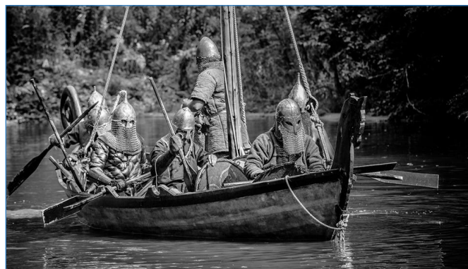
Fig. 2. Hungarian Vikings rowing the waters in Emese Park.