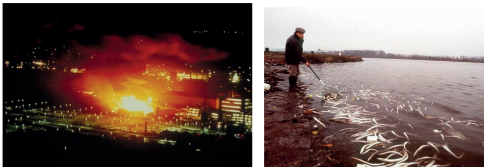
Picture 1. Accident at Sandos in 1986 in Basel, Switzerland

Incidentally emerging fire incidents in logistic facilities of logistic warehouse bases working with dangerous substances and the emission of dangerous substances into the environment from such facilities can directly endanger the environment of the facilities, and through this the surface and underground waters of the environment. On Picture 1, I have presented the consequences of the fire incident that occurred in the Sandos pharmaceutical plant in Switzerland.