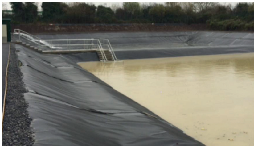
Picture 2. Fire water retention facility

The guideline presents information related to the introduction of technical, management and control measures forming parts of the so-called accident prevention action plan. It divides the dangerous substance storage systems into two categories: primary (technology) and secondary (emergency) storage systems. The guideline also specifies the rules for implementing secondary storage capacities, where polluted fire water or leaked dangerous substance can be collected. Secondary storage can be a local or remote unit. Picture 2 presents a remote storage.