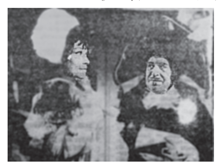
PLATE 1 Frame from A háromszögletű kalap (West German Film, 1970)

and for Falla's ballet. But finally, the man of letters is recognized simply because "many of his works were popular among Hungarian readers in the last century."<sup>21</sup>