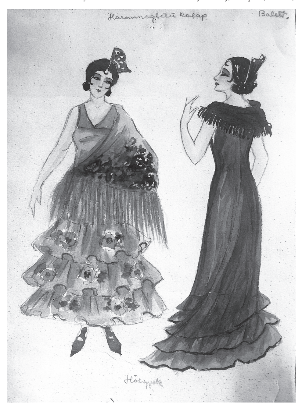
Plate 3 Clothes design for ladies by Oláh for A háromszögletű kalap (Budapest, Opera House, 1928). From the Theater History Collection of the National Széchényi Library, Budapest (KE 2139)