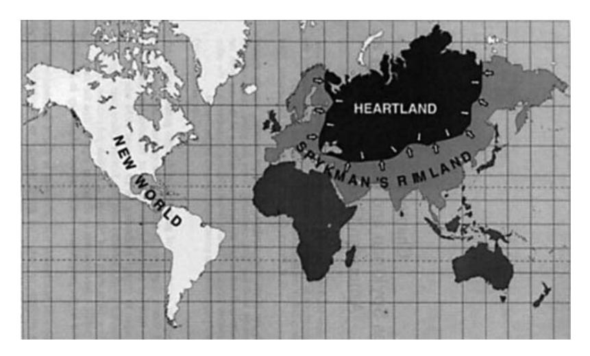
Figure 2. The concept of Rimland