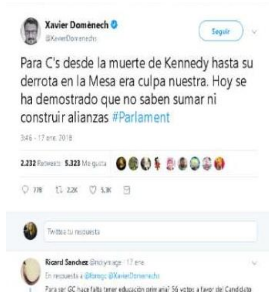
Image 6. Biased Attributions and Fallacy