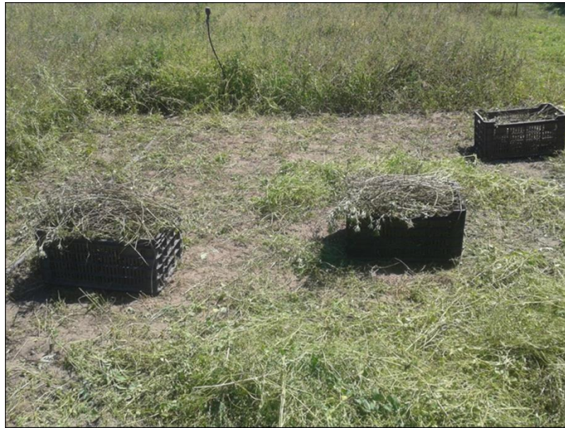
Figure 2. The harvest of fenugreek (3 th July 2018).