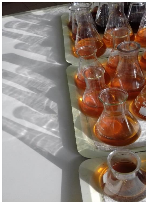
Figure 1. Prepared samples for organic matter content analysis

was over 5000. Most of the soil samples derived from vineyards and orchards, in the southern part of Great Plain. The organic matter content - referring humus content - was determined photometrically after potassium dichromate / sulfuric acid digestion (Figure 1). Determination range was from 0.2 to 4.0 m/m%. Nutrient contents were determined from soil extracts prepared according to standard 1 mol/dm 3 KCl extraction method. Mg content was measured by standard ICP-OES spectrometry (Horiba Jobin Yvon, 5-200 mg/kg, Figure 2). Pearson's linear correlation analysis was performed to reveal the relationships between the examined parameters, and the significant relationships were determined at significance levels of 5%, 2%, 1% and 0.1%.