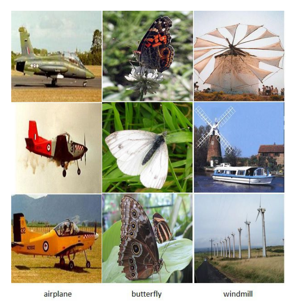
Figure 1: Example images from the Caltech101 and Caltech256 datasets. The airplane, butterfly and windmill categories are represented by the left, middle and right columns, respectively.

Caltech256 [25] datasets. Example images from these datasets are shown in Fig. 1.