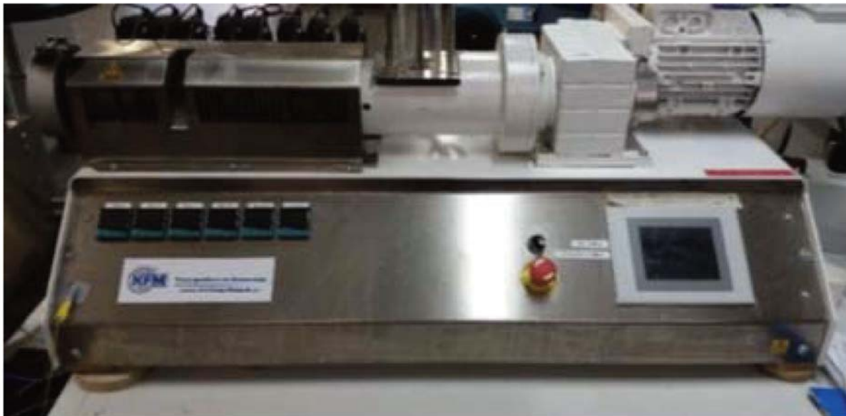
Figure 2. Example of extrusion machine

First drying PET prepared for extrusion, after the material is shredded and dried, its ready to be extruded. The 'Next filament extruder' was used for the extrusion of PET (shredded format).