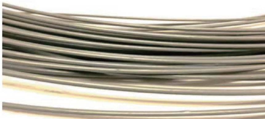
Figure 6. Produced filament from PET