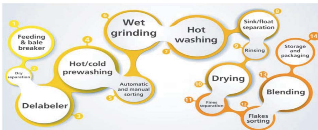
Figure 1. PET plastic recycling steps

The grinding process was carried out in the FKF ZRT. (see in Fig. 1):