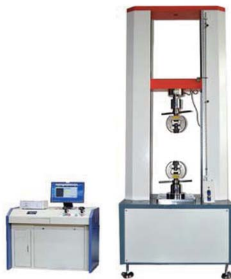
Figure 4. Material testing machine, Testometric

Tensile testing was performed by using a material testing machine, Testometric M 350- 5CT see Figure 4 (faculty of mechanical engineering SZIE).