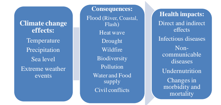
Figure 1. Potential impacts of global climate change on human health