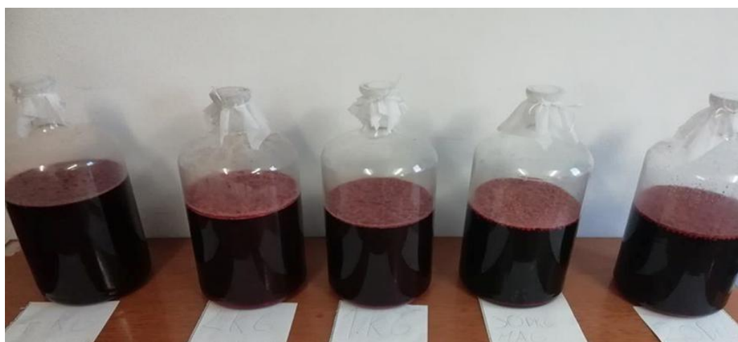
Figure 1. Fermenting vinasse

The first process was cleaning and removing stalk, leaves and other contaminants that came in during picking. Prepared fruits were pitted by a juicer and grinded. The resulting pulp was mixed with water in a 1: 1 ratio and allowed to mature for 4 days in a covered stainless steel pan. First I removed the floating peel and pulp from the top of the fermenting vinasse, then filtered through a small hole filter and poured it into a glass container. The mouth of the container was so closed that excess carbon dioxide could escape, but air could not infiltrate to the wine, because various wine defects would appear. When the wine was ready I covered it with a well-ventilated fabric to prevent the vinegar flies from accessing it, but the carbon dioxide that was produced could escape.