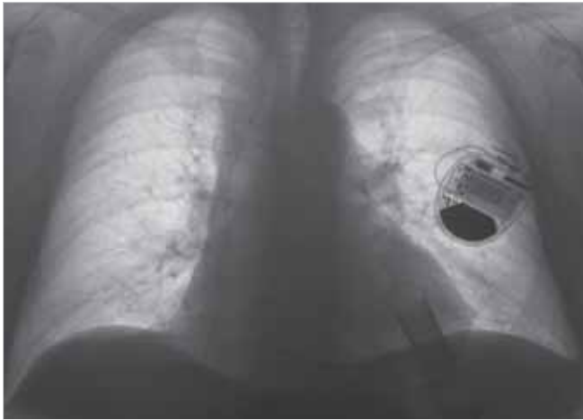
FIGURE 1. Patient's chest X-ray showing the position of the VVI-ICD system and left ventricular assist device in AP view

The patient was scheduled for box replacement (current battery voltage=2.64 V, ERI=2.61 V) and a potential lead revision. Intraoperatively we attempted to maximize the R-wave amplitude and prevent lead revision by testing both true bipolar (tip to ring) and integrated bipolar (tip to coil) sensing vectors. This assessment revealed that tip to coil sensing resulted R-wave amplitudes >5.0 mV compared to tip to ring sensing (2.1–4.8 mV). Since some of the newer generation ICDs have the option to change the sensing vector, we decided to implant such a device (Medtronic Evera S VR, DV-BC3D1), programming the sensing vector to integrated bipolar, without need of further lead revision.