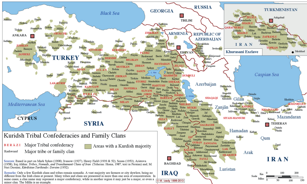
Map 1 Kurds in the Middle East 2

Rojava, West in Kurdish, is the colloquial name to describe the de facto autonomous region in Northern Syria, officially called Rojava–Democratic Federation of Northern Syria. The territory is the southward extension of the Kurdish populated area in Turkey. 1 Kurds, who number around 30 to 40 million, are deemed to be the biggest nation on earth without a state of their own.