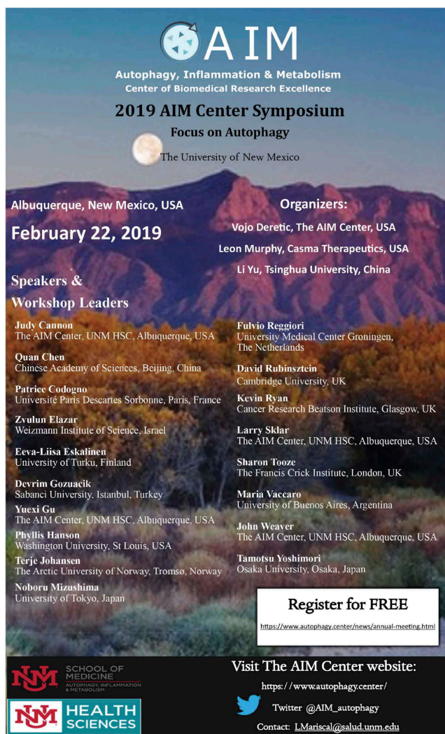
Figure 2. The 2019 AIM symposium scientific program and poster.