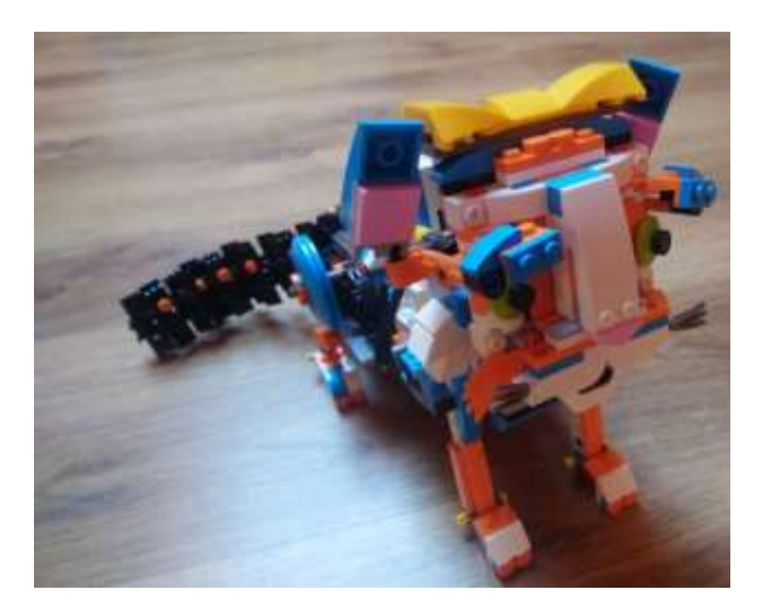
Fig. 2. LEGO BOOST

There are cases where the demonstration of an interaction is dangerous or costly, such as the possibilities of material creation (annex 5), in which cases the applicability of digital technology is also clear.