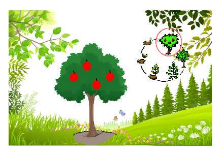
Fig. 4. Plant development project