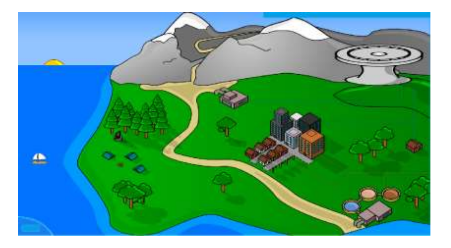
Fig. 1. Paddleboat

In the case of the topic of the second annex (water cycle, forms of appearance in nature), the mentioned content and extent can be a fundamental obstacle, but with the help of the proposed application we can make it simple and easy to understand. For the lower age group, the GCompris application helps the understanding; in the upper grade we can optionally model the process with the help of program code.