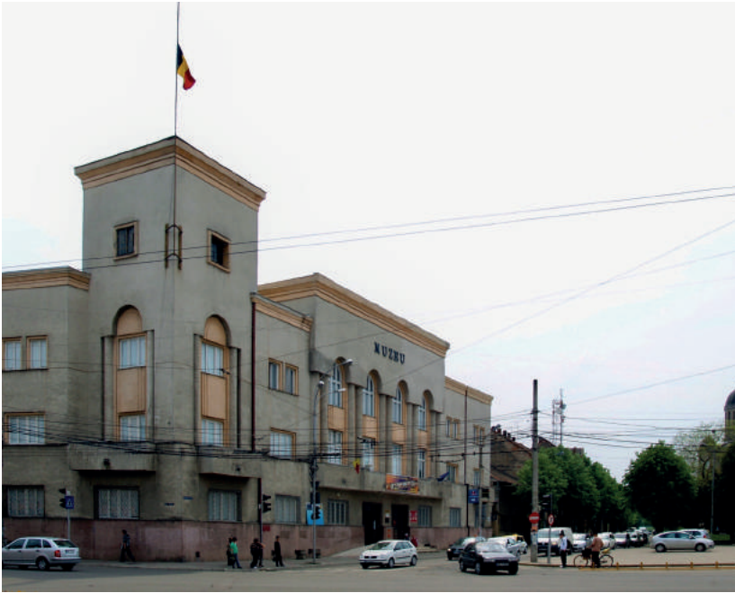
The building of the prefect's office in Satu Mare (Szatmárnémeti) completed in 1936. Today it hosts the County Museum of Satu Mare. In the background we see the Orthodox Cathedral built in 1937–1938.