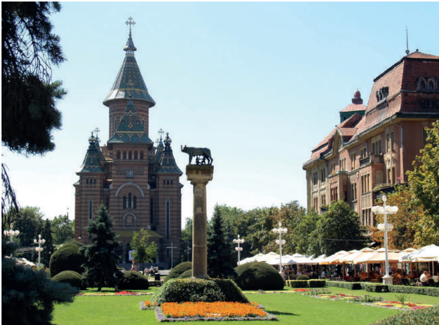
The centre of Timișoara (Temesvár, Temeswar) with the Orthodox Cathedral (from the second half of the 1930s) and the replica of the Capitoline Wolf statue.

that the supremacy of Hungarians and the civilizing role of the Hungarian state should be used as arguments for keeping the territorial integrity of Hungary. 4 Hence, the fact that Romania received the sanction of the powers for occupying Transylvania and the Hungarian sense of mission triggered cognitive dissonance between the image of Romanians and the Hungarian sense of mission. This led to a discourse which centred on the paradox between the position for which Hungarians should be “entitled to” and the actual situation. The contradiction between the actual position and the “rightful place” of Hungarians in Transylvania became one of the key elements of the new discourse on Transylvania that emerged in the Hungarian public sphere and that flourished in the interwar period. Topoi that we would call elements of identity politics today, emphasizing that in a minority position all-national solidarity and holding on to the Hungarian national belonging were essential, were also important. Since this discourse, implicitly or explicitly, saw the remedy in revising the Trianon Treaty, it suited the context of contemporary revisionism.