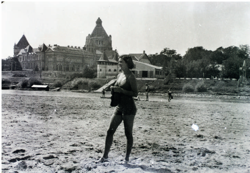
The banks of River Mureș in Arad (Arad) with the Palace of Culture and the rowing club in the background.

The author expresses his optimism, too: “ It is the calling of Arad the set the standards for understanding among nationalities. ” 54