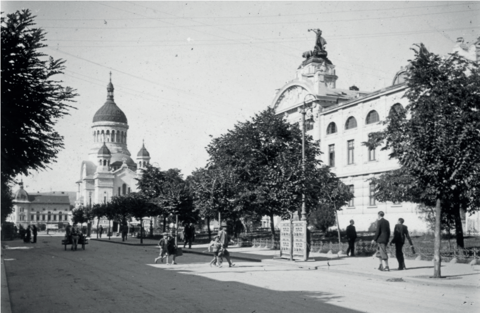
Street view from Cluj (Kolozsvár) with the Orthodox Cathedral constructed during the 1920s and 1930s and the National Theatre. Source: Fortepan/László Lajtai, 1934.

In the sections that follow, I will make an attempt to grasp how the works mentioned above presented the current status of towns in Transylvania and how they enriched the Hungarian discourse on Transylvania, especially the narrative about the alleged civilizing role of Hungarians. Among the many possible lines of inquiry, I will focus on how they assessed the changes, what they believed social transformation entailed, how they thought of modernity and how they represented the West-East slope.