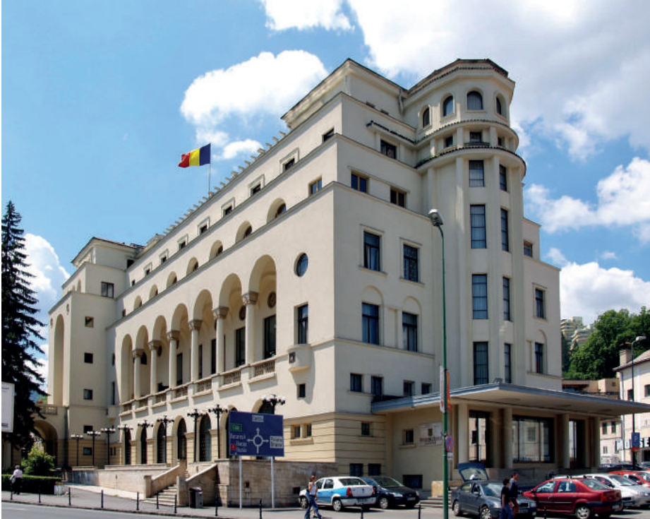
The building of the Cercul Militar (Club of Army Officers) in Braşov constructed cc. 1930s and 1940s.