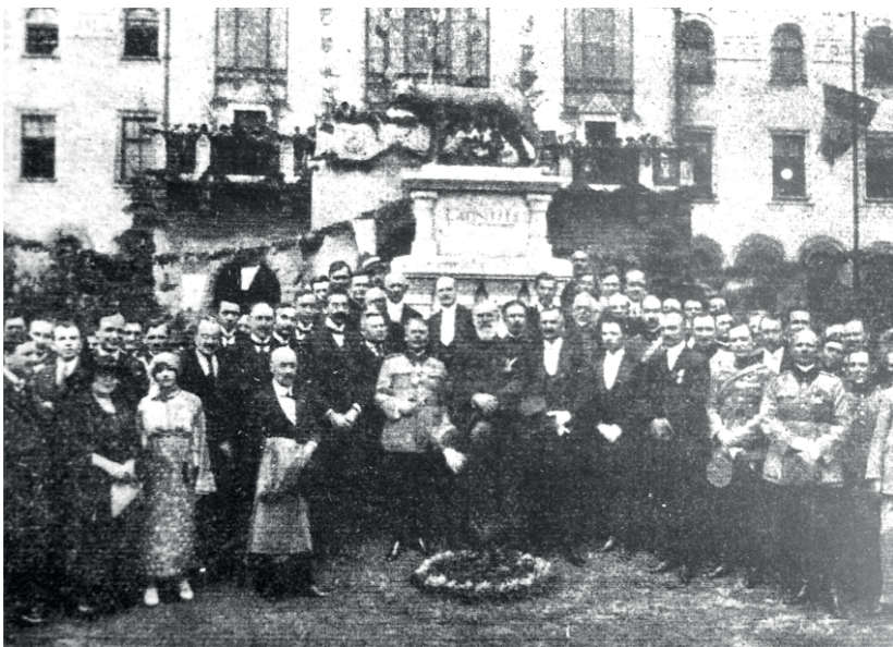
Inauguration ceremony of the “monument of Latinity” (replica of the Capitoline Wolf statue in Rome) in Târgu Mureș (Marosvásárhely), 1924.