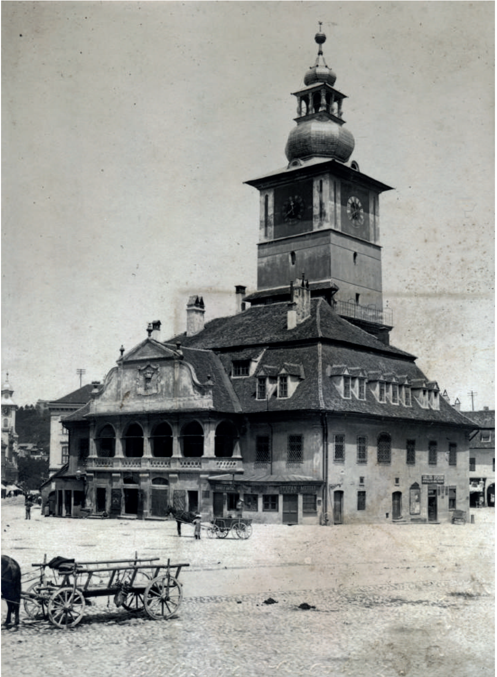
The old City Hall in the main square of Braşov (Brassó, Kronstadt) in 1920.