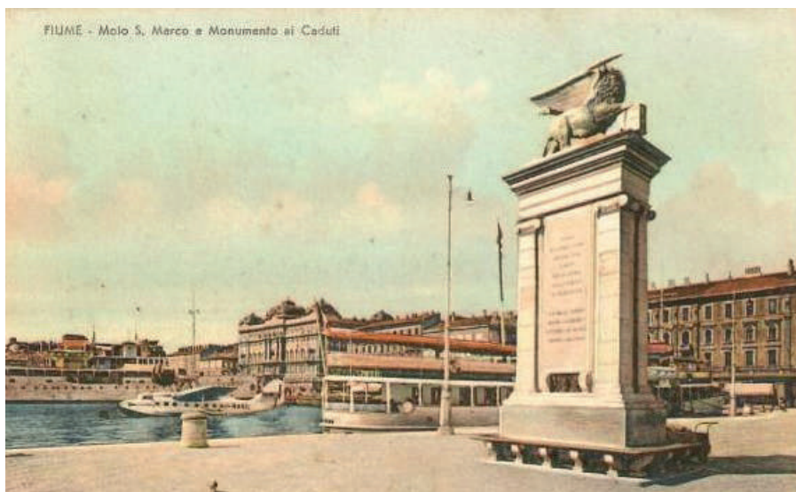
The Venetian Lion. 51