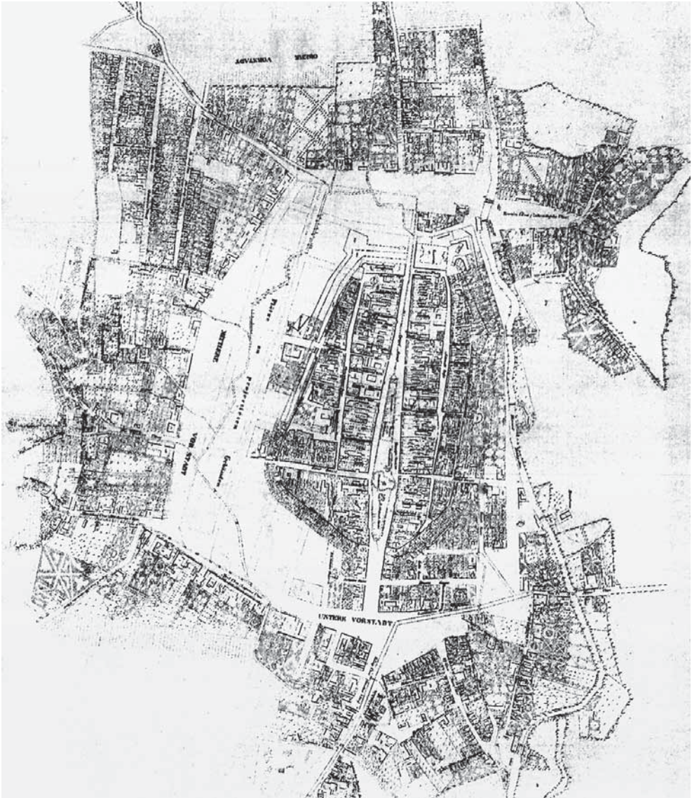
Figure 5. Joseph Ott's map of Kassa, from roughly 1830.

Source: "Plan der königl. Freistadt Kaschau" (Joseph Ott).