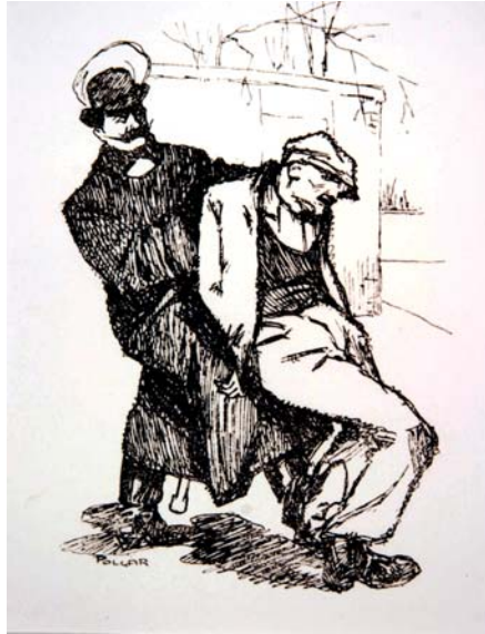
Figure 1. Police officer catching a criminal.

The system described above remained unchanged over subsequent years. Police manuals and guide books published beginning in the 1900s illustrate the unique aspects of the Budapest police's surveillance service. Perhaps the most important of these publications was the 1906 Rendőrközegek tankönyve [Police Officer's Handbook], which offered detailed information regarding the Budapest police's surveillance service. The text book reveals that four police officers were assigned to posts located outside buildings and two police officers were assigned to posts located inside buildings. 9 The book states that police officers were prohibited from engaging in the following activities while on duty: leaving their post without permission, smoking or sleeping at their posts, entering a location requiring police surveillance without reason, partaking in "unwarranted conversation" and