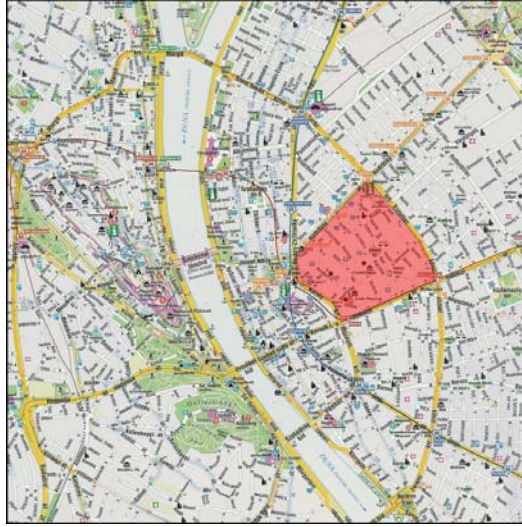
Figure 1. Map of the inner city of Budapest, with “the old Jewish district of Pest” highlighted. 12 Edited by the author

retrospectively, on the basis of their formal religious affiliation and especially on the basis of their origins, may be misguided on several grounds and amount to the denial of those people’s own chosen identities. 13 The anti-Jewish laws of 1939 and 1941 in Hungary were based precisely on that kind of denial: they lumped together diverse groups of people often by nothing else than legally imposed racial criteria. Some of these individuals indeed had strong Jewish identities. Some of them, although still formally Jewish (i.e. belonging to the izraelita denomination), were thoroughly secularized and would have long left their Jewish identities behind if the intensifying anti-Semitism of the era had not constantly reminded them of their roots. Many other people classified as Jewish by the racial laws of 1939 and 1941 were not even Jewish by formal criteria; they had been baptized as Christians earlier or were born into families who were already members of Christian denominations.