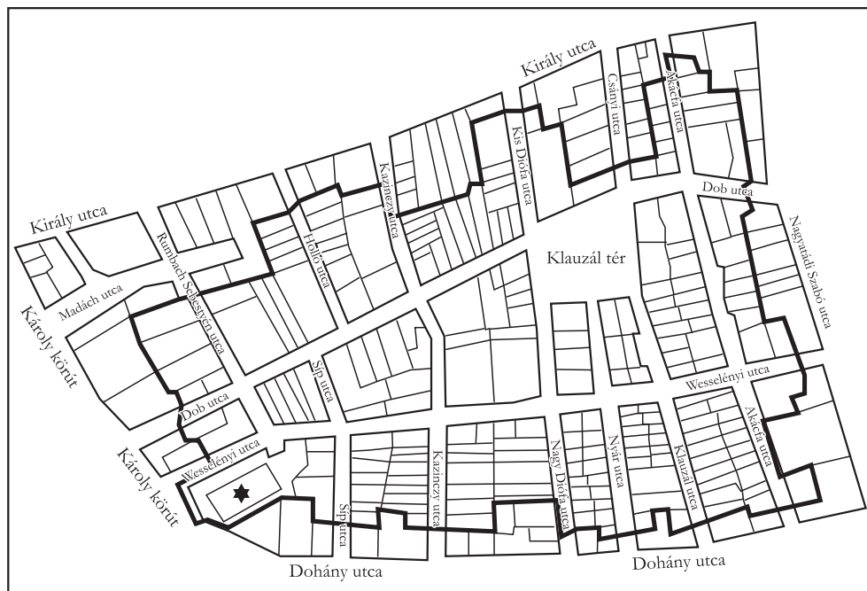
Figure 3. The walled-in ghetto in the inner 7th district 42

One has to be careful, however, not to draw an entirely idealized picture. The discussion of professional relations raises an issue that may represent a more problematic side of Jewish-non-Jewish relations in and around Klauzál tér. Under the second and third anti-Jewish laws, several shopkeepers and artisans lost their licenses or could not renew them after they expired in 1939. Christian practitioners of the same trades obviously benefited from the decrease in competition. In the case of retailers, non-Jewish applicants could apply for the rental contracts of shops lost by Jews. These are, however, hypothetical considerations; as the census records show, the great majority of shops around Klauzál tér were still owned or rented by denominationally Jewish persons in early 1941. 43 Further research is needed to find cases in which Jewish shopkeepers on Klauzál tér lost their businesses as a result of the anti-Jewish laws; neither have I encountered any documented cases of Jewish shops on Klauzál tér taken over by Christians.