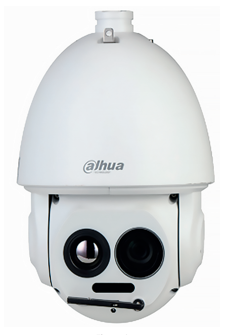
Figure 1 Dahua Ultra Series DH-TPC-SD8621-T

In order to be able to utilise a camera in the role of fire protection, it must be equipped with a heat sensor. Thermography occurs in objects hotter than -237 degrees Celsius and emitting infra-red waves. These waves are invisible to the human eye. However, the camera with thermal imaging converts the waves to electric signals, so they appear as thermal images to a human observer.<sup>5</sup> The figure below shows a Dahua Ultra series thermal imaging camera, which would even be suitable among the strict conditions at the universities.