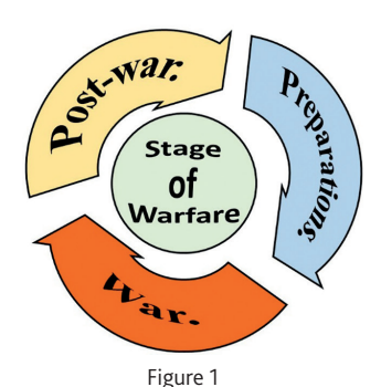
Taxonomy of Warfare ecology. Created by the author, source: [4: 729].