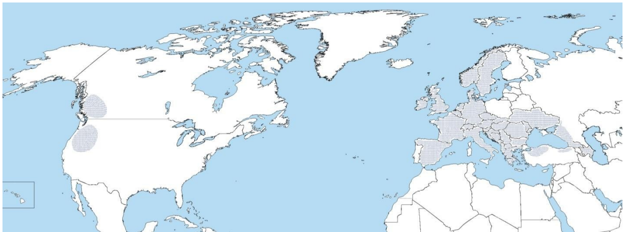
Figure 1. Distribution of D. attemsi in the world.

The northernmost records (Sweden, Ireland, England) of D. attemsi raise the serious question, i.e. is it native or introduced to the fauna. According to Omodeo (1952), it spreads from the Caucasian area towards Romania and from there migrated to the Balkan Peninsula and, across the Dinaric range, to Austria. Following this view and, as well, based on their investigation, Rota & Erseus (1997) considered that D. attemsi has two core areas of distribution. The centre of its western distribution is France, and from there it spreads towards Italy, Spain and, as well, to the north into Great Britain and Ireland. Therefore, Rota & Erseus (1997) assume that all records from sandy woodland soils from England and Sweden most likely indicate post-glacial expansion of D. attemsi . This is also supported by Bouché (1972) who pointed out that D. attemsi lives naturally in organic rich woodland soils. However, in northern countries it has a very restricted distribution in natural biotopes and is generally considered rare in those areas (Schmidt et al. 2015).