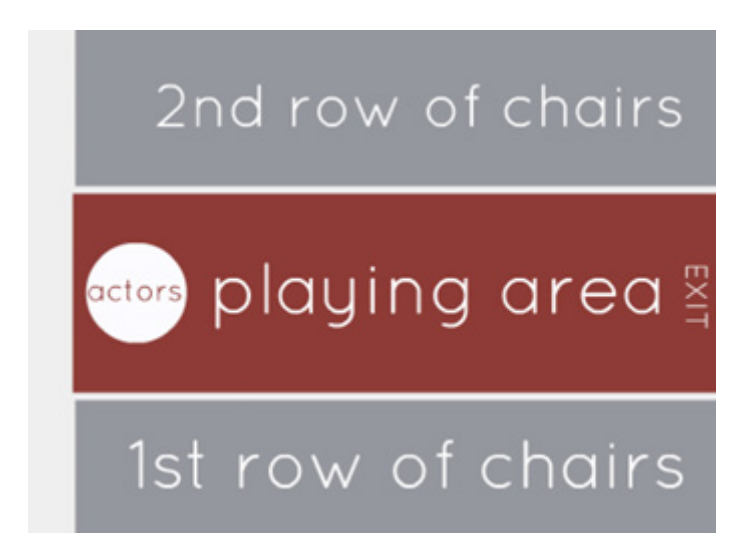
Fig. 1. Seating arrangement in K.V. Company's Cloud Nine (the author's illustration)

Cloud Nine was not performed on the main stage of Trafó House of Contemporary Arts, but downstairs, in the basement. Using a smaller space for the performance contributed to a forced familiarity between spectators and actors. The actors were waiting for the spectators in costume, playing their roles wordlessly in a tableau vivant. The members of the audience had to cross the playing area, thus entering the actor's sphere if they wanted to take their seat in the second row of chairs (see fig. 1).