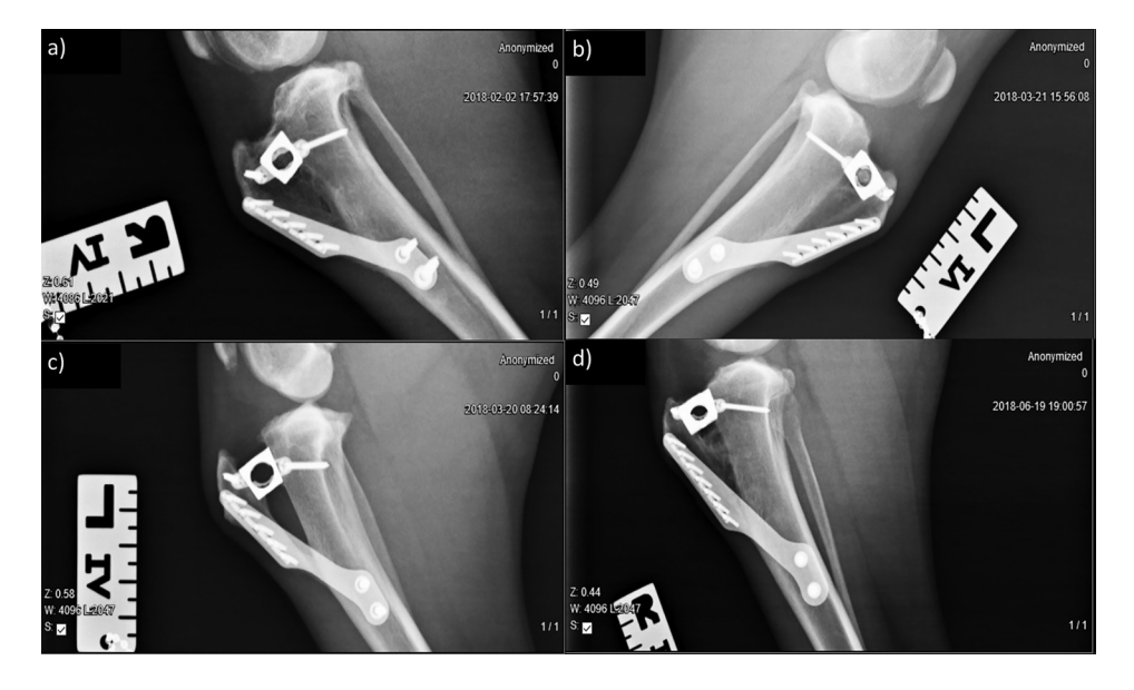
Fig. 1. Tracking of callus formation 3 months after surgery. The differences between the different treatment groups are visible. There is a marked absence of bone callus in G2 (c), most likely due to inadequate scaffold degradation, which hindered the spread of cells from the cancellous bone exposed in the osteotomy gap. Callus formation in CG (a) is slightly thinner than in G3 (d), indicating a positive effect of autologous mesenchymal stem cells on bone healing