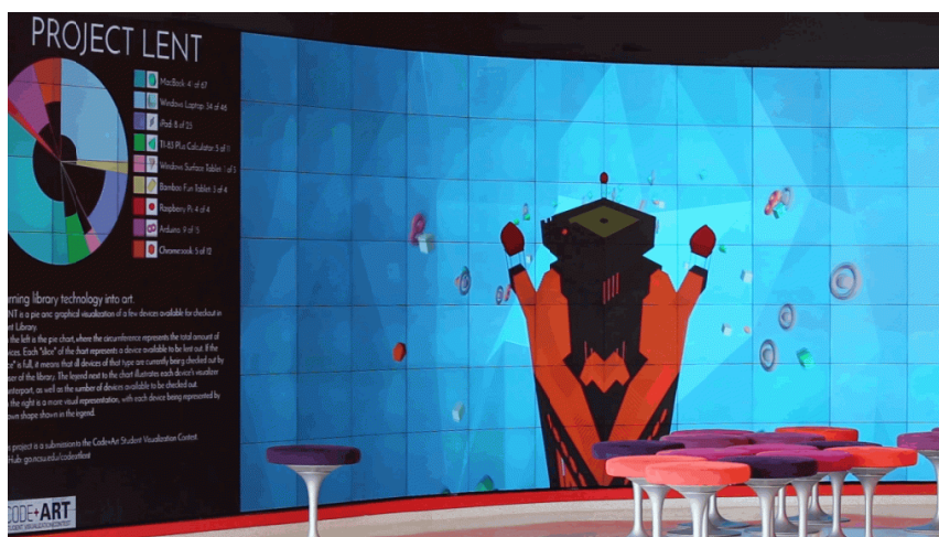
Figure 3. Learning space at the Hunt Library (North Carolina State University) (“iPearl Immersion Theater”, 2020).

Libraries have to provide a feeling of customization for the readers along with serving as locations for cooperative efforts. Thus in the United States such libraries have been developed, which function as a combined location for thinking, creativity, and comfort.