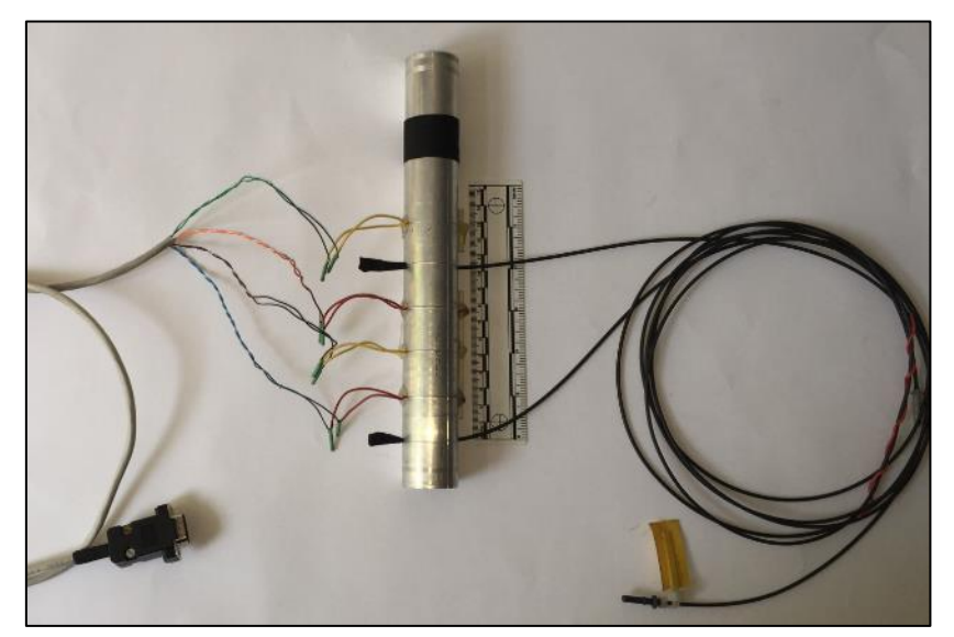
Figure 15: Jet velocity measurement setup with two different methods