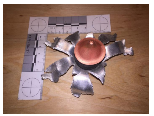
Figure 12: Result of 22,6 g Composite-B.

In case of binary explosives, classic nitroparaffin and ammonium-nitrate mixtures were used. Comparing this mixtures effectiveness to RDX or PETN containing explosives definite recession is perceptible, even so, the jet formation exists. All those materials which detonation properties highly dependent on the diameter and the confinement this test shows the correlation between this circumstance and their performance. The large fraction prill containing AnNm detonation has failed this partial detonation can be observed in Figure 12. The close up of recovered liner and their comparisons are on Figure 13.