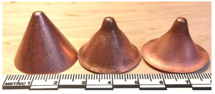
Figure 13: Intact (left) and deformed liners due to partial detonation (middle, right).