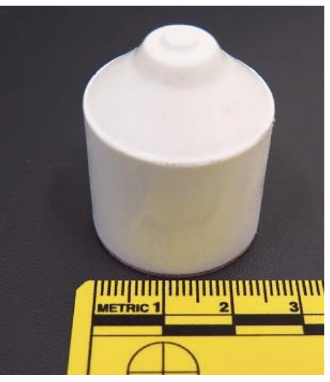
Figure 4: RDX shaped charge

Binary explosive mixture was a classical nitro-paraffin / oxidizer mixture with and without atomized aluminum.