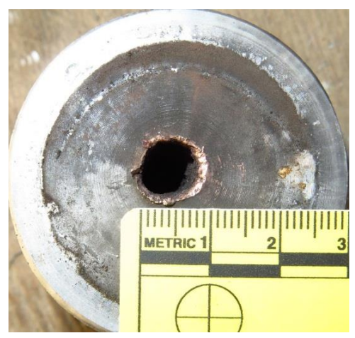
Figure 6: Result for Semtex PLHX30.

The RDX pressed charge showed some inconsistency which could be attributed to the pressing procedure. From each of the 3 blasts some amount of copper splatter remained on the surface of the discs. The average diameter at the collar was 7,3mm, and the length was 51mm.