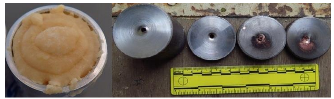
Figure 10: Result of 46,1 g Composite-B.

Although the slug remained at the collar point at the disc the penetration was almost the double as at the previous one. Diameter was10mm and the length was 61,5mm.