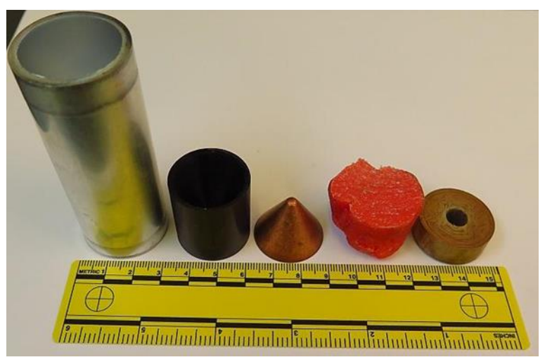
Figure 2: Shaped charge contents

The target assembly is a centralizing and clamping unit that holds the target mild steel discs tightly together and holds the shaped charge in the proper place. The two, separate central aligned fixtures hold the target assembly by three screws and a small ditch inside, while they pull and lock the discs together. This structure allows a fast, convenient way of testing as the settings can be varied quickly as different disc sequence can be adjusted. For example, if we predict that the penetration will be bigger than 50mm, first we place the 50mm disc then 10mm or 20 mm. In case of smaller penetration thinner discs can placed under the charge. The setup eliminates the human-borne positioning errors. Due to the standoff distance the explosion does not damage the head part and up to now, the device withstands several dozens of blasts.