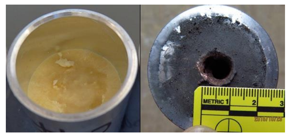
Figure 8: Result of 25,1g Composite-B.

This amount of composition barely covered the liner. The diameter was 9,4mm, the length was 32,3mm