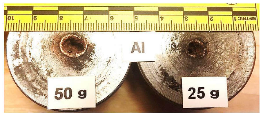
Figure 14: AnNmAl 50-25g targets

The AnNm and AnNmAl compositions were tested in 50g and 25g trials to examine the penetration decrease due to the lower charge weight.