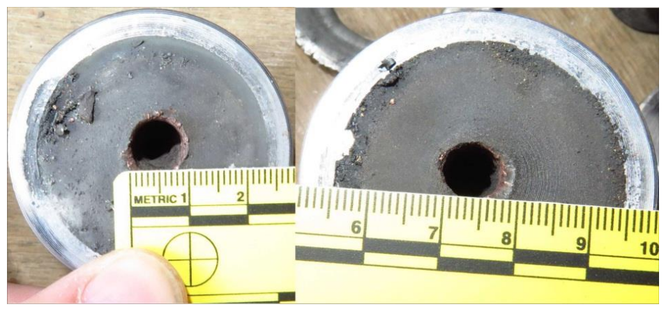
Figure 5: Result for Semtex 1A with (right), and without waveshaper (left)

First the plastic explosives were tested. During the experiments the collar diameter of the hole and the depth of penetration were measured.