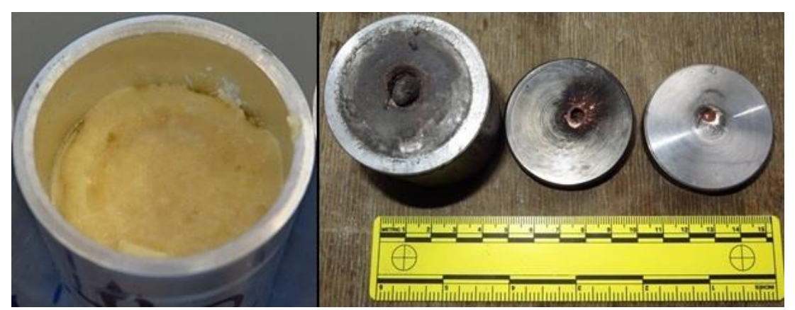
Figure 9: Result of 30,8 g Composite-B.

This amount of composition barely covered the liner. The diameter was 9,4mm, the length was 32,3mm