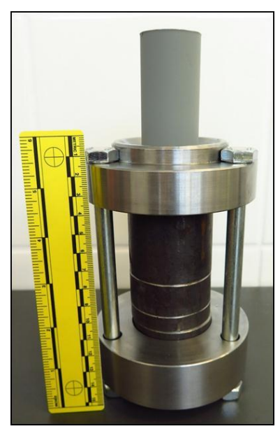
Figure 3: Target assembly with a shaped charge on the top