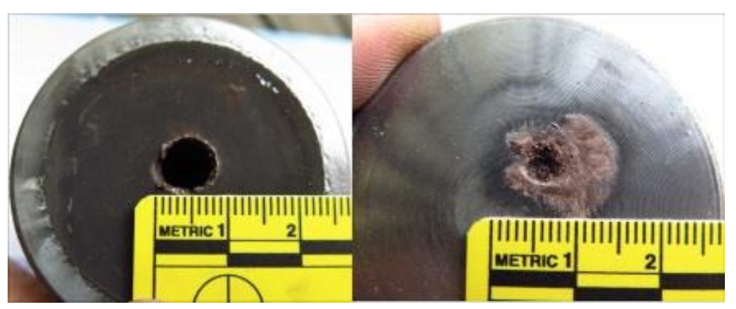
Figure 7: Pressed RDX charge entry (left), and the jet on the second disc (right).

The RDX pressed charge showed some inconsistency which could be attributed to the pressing procedure. From each of the 3 blasts some amount of copper splatter remained on the surface of the discs. The average diameter at the collar was 7,3mm, and the length was 51mm.