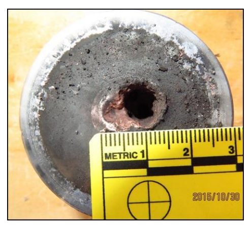
Figure 11: Result of 22,6 g Composite-B.

At this test, the effect of the asymmetrical jet formation can be seen. Presumably, the tail part (slug) came off and deformed the collar of the hole. The diameter was 9,2mm, the length was 31mm.