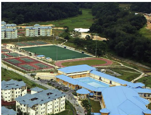
Fig. 1. The IIUM sports complex

Among the various athletic teams, the football team of the IIUM was chosen for this study. The participants, (i.e. IIUM football team) were systematically grouped into two categories according to their athletic scholarship’s status and this categorization was used as the basis of research analysis and particularly to figure out the impact of the athletic scholarship on students’ football achievement motivation. Consequently, Table 5 has outlined the frequencies of what motivate the athletic students of IIUM concerning their football achievement motivation. There were collaborations in the responses of the two categories of the study as regard to about seven items of SMS survey instrument. However, the result portrays variations in four of the items which was one of the tangible and logical reasons for the induction of the supplementary interviews. The group B of the study, (i.e. non-recipients of athletic scholarship) those students who voluntarily joined the university (IIUM) football team without any initial agreement of athletic scholarship claimed ( m = 2.89 ) that, they use to have great reasons for their willingness