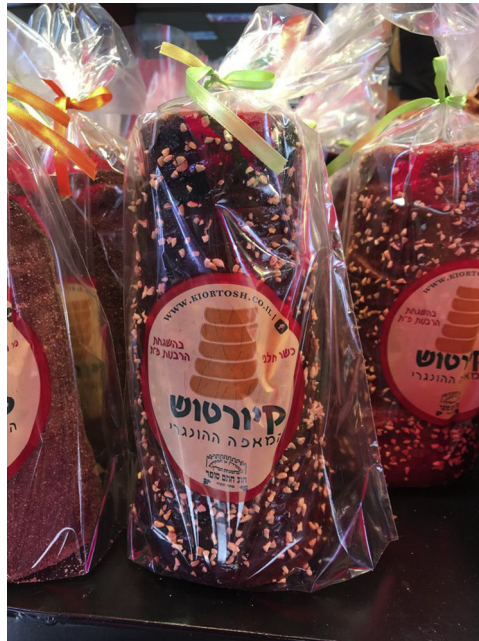
Fig. 4. A bunch of 'kürtös' at the Carmel market