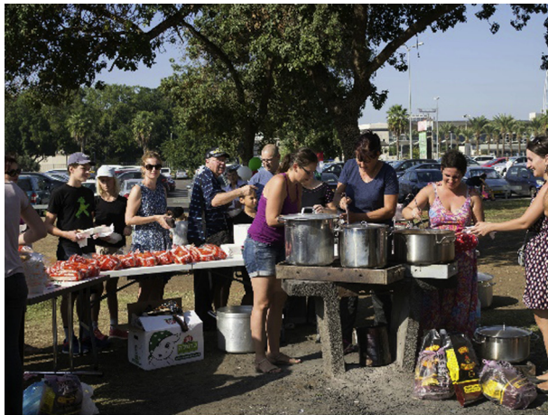
Fig. 6. Gulyásparti (goulash-party)

The most famous Hungarian dish worldwide is goulash (gulyás in Hungarian), some people call it the national dish or the symbol of the country. It is either a stew or soup of meat and vegetables usually seasoned with paprika and other spices. The popularity of world-recognised food has launched an initiative which was called: Gulyásparti , i.e. goulash-party. The first Gulyásparti was in 2015, organised by a young Hungarian scholarship-holder who was sent to Israel under the Kőrösi Csoma Sándor programme (this program of the Hungarian government targets more remote countries, mostly the Hungarian diaspora, and assigns young Hungarians every year to help Hungarian communities preserve their identity and language). Since 2015 there were three very successful and large Gulyásparti-s and a smaller event in 2018 which was more like a cooking competition than the previous events where people were hosted. The idea behind these events was built around a dish, but this dish is kind of a legend and has a very specific symbol within the community. Hundreds of people participated from the youngest to the oldest generations. Even those came who are not particularly engaged to the community for different reasons (ideology, politics, history, attitude), but an event with only one ideological objective (to entertain and spend time together) served them all.