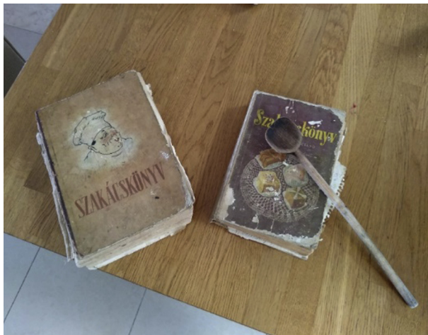
Fig. 10. Old Hungarian cookbooks in an Israeli-Hungarian home in Jaffa

Photographs of old books and recipes in Israeli homes show a wide range of diversity in linguistic and cultural aspects as well. Israelis keep cooking books and notebook of recipes of their mothers and grandmothers as a treasure; items which are most dear to them. In many cases (especially refers to descendants of the Holocaust survival generation or people coming in the first waves) people of Hungarian origin are able to read the title of a recipe or the book, but the method not anymore. That they probably know by heart.