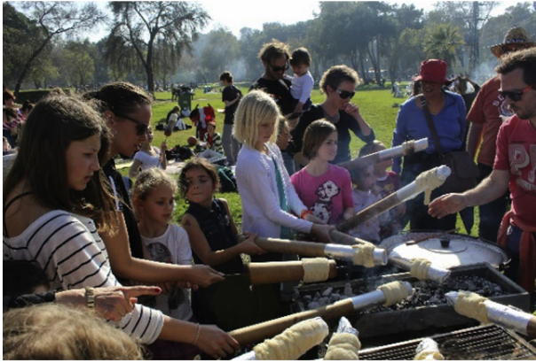
Fig. 8. Gulyásparti (goulash-party) – students and their parents