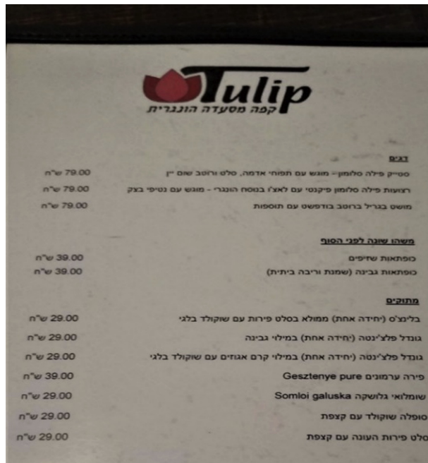
Fig. 5. The dessert menu of Tulip: Gesztenye pure (chestnut puree) and Somloi Galuska (sweet dumplings) written in Hungarian (Photographed by the author in 2019)

The couple who own the place feels that they are some kind of representatives of the Hungarian culture and language through gastronomy and hospitality. Even if they have to say the names of the food correctly a hundred times a day just to remind someone of her/his ancestors, they will do so because in this way they feel they are contributing to the preservation of the cultural heritage. They used to keep brochures, information booklets on Hungary at the restaurant, and give to their customers. Many of the guests have visited Hungary just because the owners strongly recommended it.