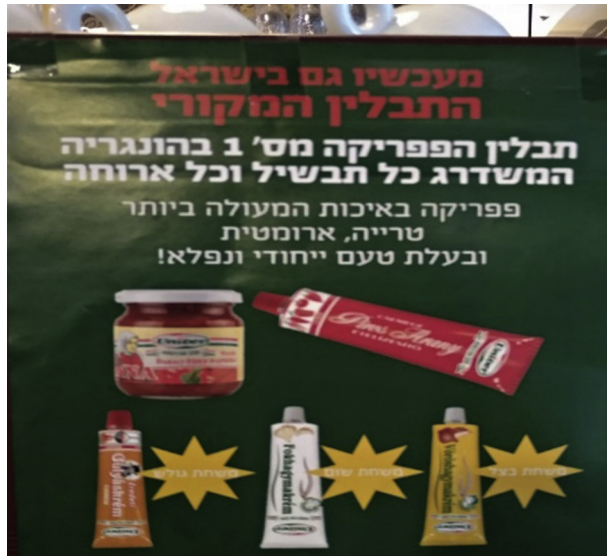
Fig. 1. Traditional Hungarian seasonings offered in an Israeli restaurant