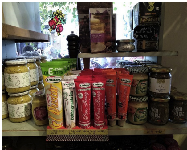
Fig. 2. Traditional Hungarian seasonings offered in an Israeli delicatessen in Jaffa