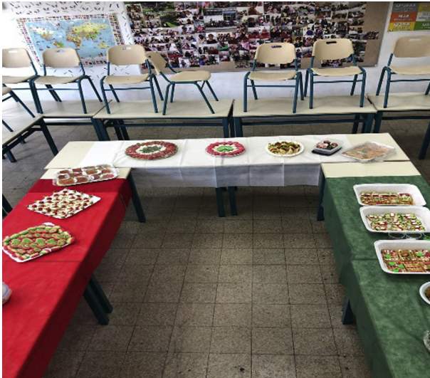
Fig. 9. Food competition on the topic of the colours of the Hungarian flag

‘Man eats – written by my father in the foreword of his Hungarian cookbook called Paprika – to live. Hungarian man lives to eat.’