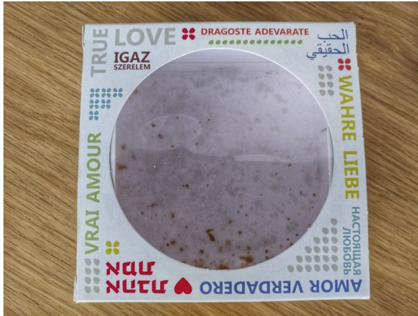
Fig. 3. A box of a cake from the bakery 'Lechamim'