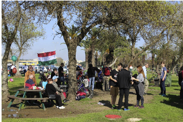
Fig. 7. Gulyásparti (goulash-party)

These gulyás (goulash)-related events were as well part of the yearly meetings of the Hungarian Kindergarten and School in Tel Aviv – they did not belong closely to the curriculum or teaching plan. However, they were a great opportunity for kids to be together on an ordinary weekend with people of Hungarian origin outside of their families.