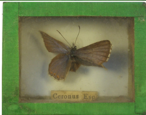
Figs 13–15. European butterfly specimens of the Koy collection: 13 = Espararge climene Esper (1783), 14 = Coenonympha thyrsis (Freyer, 1845), 15 = Lysandra bellargus (Rottemburg, 1775). Scale bar = 1 cm