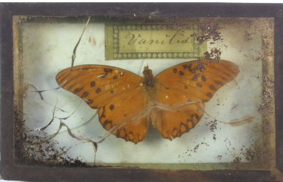
Figs 10–12. Exotic butterfly specimens of the Koy collection: 10 = Euploea core (Cramer, [1780]), 11 = Heliconius sara (Fabricius, 1793), 12 = Agraulis vanillae (Linnaeus, 1758). Scale bar = 1 cm