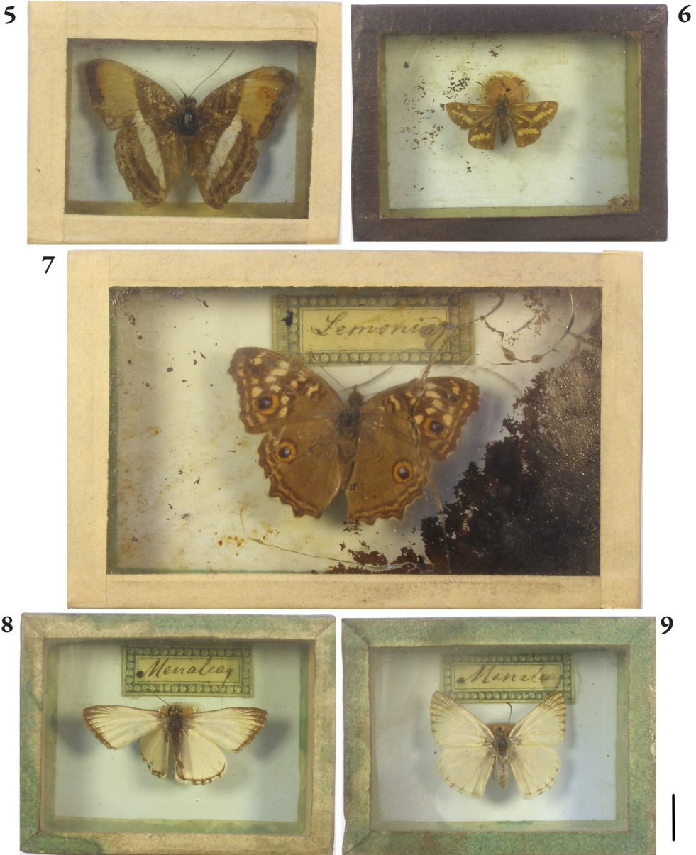
Figs 5–9. Exotic butterfly and skipper specimens of the Koy collection: 5 = Adelpha cytherea (Linnaeus, 1758), 6 = Potanthus dara (Kollar, [1844]), 7 = Junonia lemonias (Linnaeus, 1758), 8–9 = Heliopetes arsalte (Linnaeus, 1758). Scale bar = 1 cm