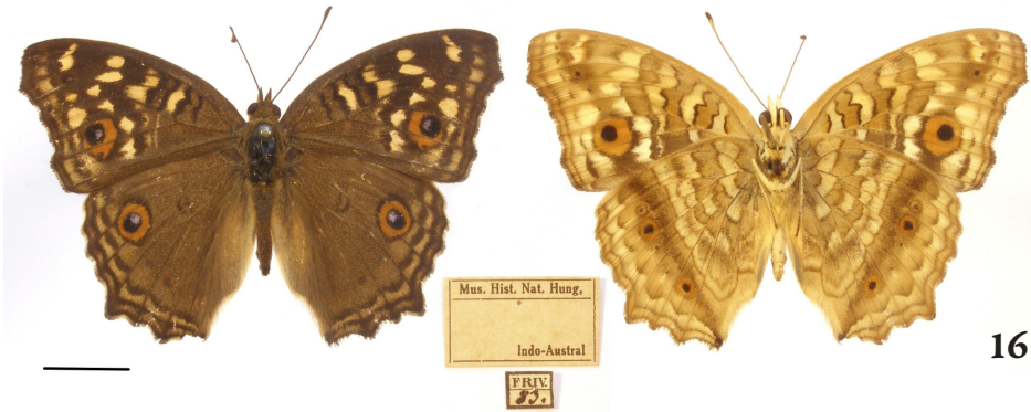
Fig. 16. Pinned specimen of exotic butterfly Junonia lemonias (Linnaeus, 1758) and its labels from the Frivaldszky collection. Scale bar = 1 cm