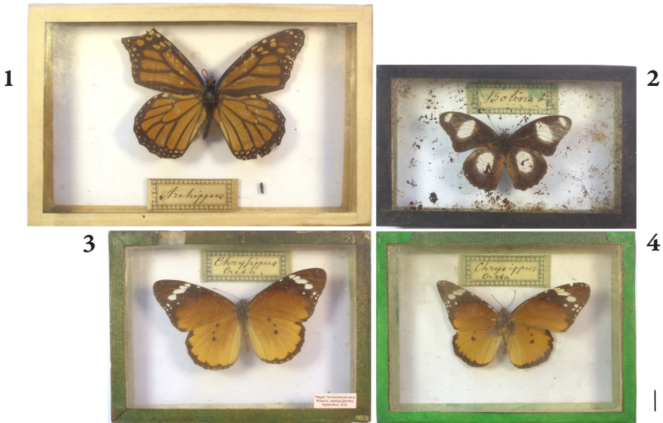
Figs 1–4. Exotic butterfly specimens of the Koy collection: 1 = Danaus plexippus (Linnaeus, 1758), 2 = Hypolimnas bolina (Linnaeus, 1758), 3–4 = Danaus chrysippus (Linnaeus, 1758).