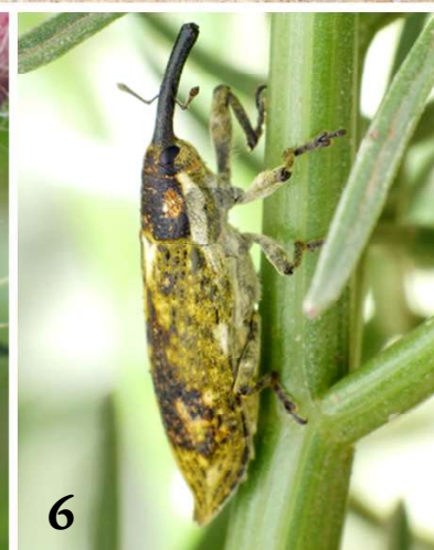
Figs 1–6. Photos in nature: 1 = collecting site at Tannourine Cedars Natural Reserve, 2 = Phaenotheriosoma besucheti Frieser, 1978, 3 = Brachycerus aegyptiacus Olivier, 1807, 4 = Meneleon signaticollis (Gyllenhal, 1834), 5 = Larinus onopordi (Fabricius, 1787), 6 = Lixus rectodorsalis Petri, 1904. Not to scale