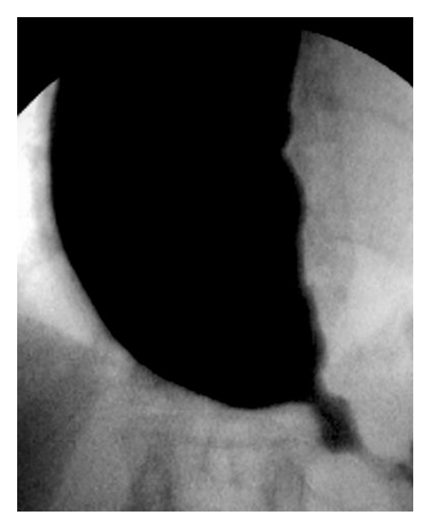
Figure 1 Sliding type hiatal hernia and remarkably dilated esophageal body.

A 65-year-old woman was admitted with severe dysphagia and regular vomiting after meals. In her history, she had 7 years of typical reflux symptoms (heartburn and regurgitation) with no dysphagia experienced during that time. Her first esophagogastroscopy was performed 2 years before her admission, which showed Savary-Miller stage II esophagitis and a sliding type hiatal hernia. The patient was put on proton pump inhibitors (PPIs). A control endoscopy 1 year later showed no signs of esophagitis with a normal cardia and stomach. During the year before her admittance, her reflux symptoms disappeared, but dysphagia developed. Endoscopy found esophageal dilatation with esophagitis and narrowed cardia, while biopsies from the distal esophagus showed chronic esophagitis and Barrett's metaplasia. Barium swallow confirmed the endoscopic findings and showed esophageal dilatation and a sliding type hiatal hernia (Figure 1). Manometry showed an LES pressure of 34.3 mmHg with 11.5% relaxation. Twenty-four-hour pH-metry showed acid reflux with multiple sharp dips,