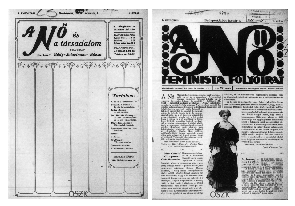
Fig. 1 The cover pages of the first issues of A Nő és a társadalom (1907) and A Nő (1914)