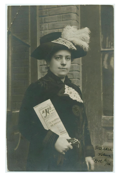
Fig. 2 The founders of the Hungarian Feminist Association, Rózsa Schwimmer (1877–1948) and Vilma Glücklich (1872–1927). Glücklich is holding a copy of A Nő és a Társadalom

of the organization in Geneva in 1924–26. Glücklich died after a long illness at the age of forty-five and was commemorated by many activists of the women's movement.<sup>19</sup>