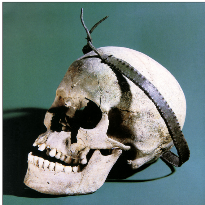
Fig. 3. The diadem of Vörs