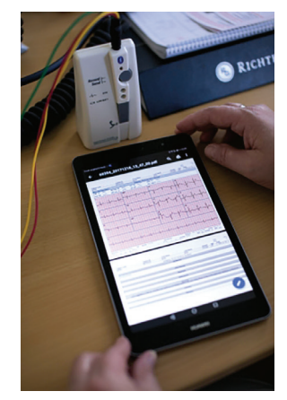
Figure 8 ECG image recorded by TTEKG on the Intelligent On-Board Terminal