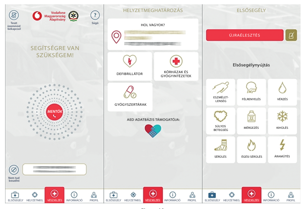
Figure 10 Lifesaving mobile application interface

Basic first aid knowledge can also be obtained from the application, as well as public information on hospitals, clinics, pharmacies and information about defibrillators placed in public areas is also available. The application also works in Austria and in the Czech Republic, as well as in certain areas of Slovakia, thus help is available even from abroad (Figure 10).