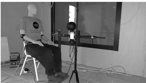
Fig. 2. Measuring installation showing the manikin and the comfort-meter in the vicinity of the electrically heated glazing

It is important to note, that an indoor space is within the neutral zone when the PMV falls between -0.5 and +0.5