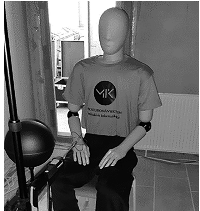
Fig. 1. The thermal manikin in a sitting position within the thermal chamber

manikin to withstand continuous movement, dressing and undressing. Polyoxymethylene, also known as polyacetal, is a synthetic, so-called engineering plastic [7]. Figure 1 shows the manikin used in the project in a sitting position wearing typical summer clothing. The clothing items include a short sleeved, light shirt, socks and straight, light trousers.