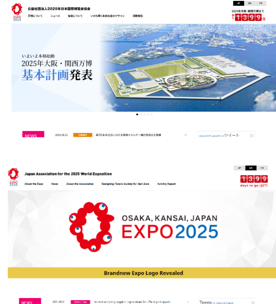
Figure 2. Osaka Expo 2025