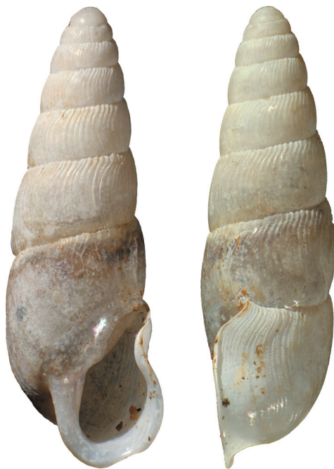
Figs 1–2. Elma matskasii sp. nov., holotype

situated on the banks of the Red River, a hilly region of woods and agricultural lands.”]. Holotype HNHM 98819/1, Paratypes HNHM 98820/7 = 3 ad., 4 juv.) (Hungarian Natural History Museum, Budapest).