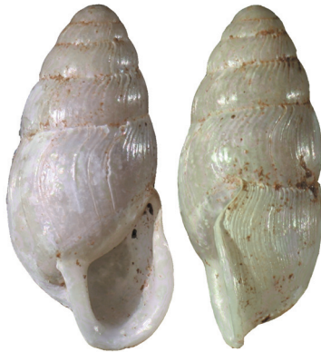
Figs 13–14. Elma tonkiniana (7.5 mm), Co Xan