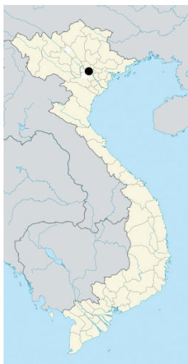
Map 1. The type locality of Elma matskasii n. sp. in Vietnam