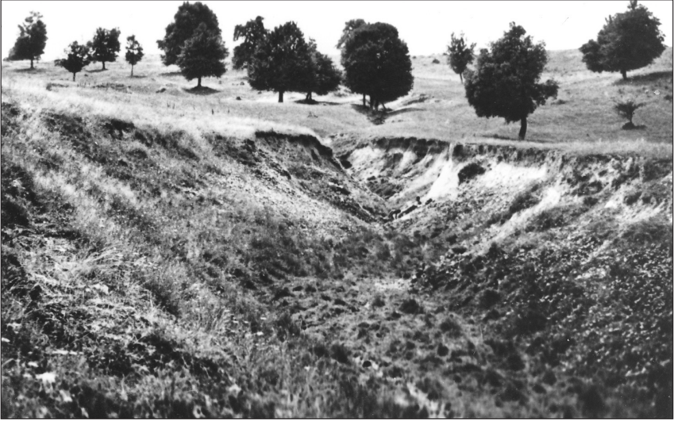
Fig. 2. Sediments revealed by a gully (site visit, 1964)