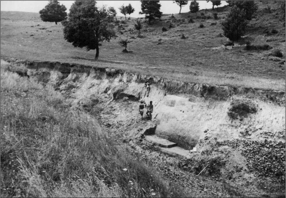
Fig. 3. The profile in the gully, excavated in 1969