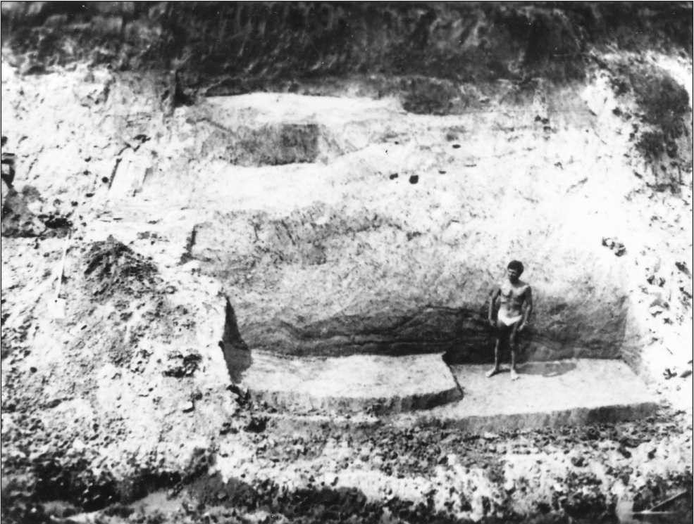
Fig. 4. The profile, excavated in 1969

The site was discovered on a site visit in 1964 by Ernő Horváth, the late paleobotanist of the Savaria Museum, Szombathely: “The glacial layers are revealed by a gully falling into the Toka Stream. Under the loess, sandy loess and loessial sand layers of the glacial layer, I found a grey sludge layer, which preserved the branch and stalk moulds of different plants. [...] Samples were taken from 16 levels of the excavations, since Molluscs can be collected almost in the whole area of the revealed 7–metre high wall.” (HORVÁTH 1973).