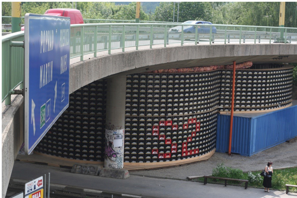
Figure 4. Station archive: Stanica S2 2009.

Available at: http://archiv.stanica.sk/2013/02/s2/ (Accessed 25 October 2020).