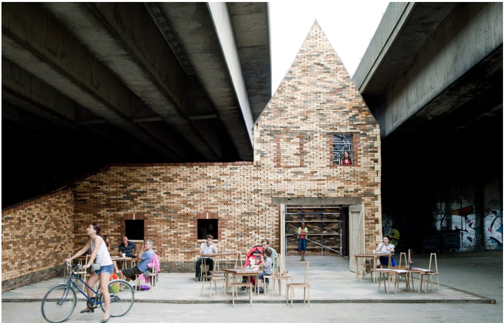
Figure 2. Vintiner, David: Folly For a Flyover. 2011.

This project was commissioned by the group Create London as part of the Create festival. In a short time, it hosted an extensive program consisting of cinemas, theater and performances. The program was created and administered by the Assemble in conjunction with the Barbican