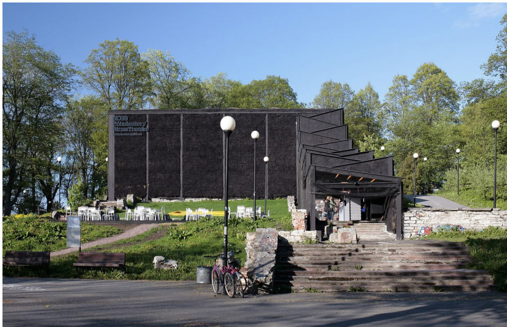
Figure 1. Siplane, Martin: NO99 Straw theater. 2011.

Available at: https://salto.ee/projects/no99-straw-theatre/ (Accessed 25 October 2020).