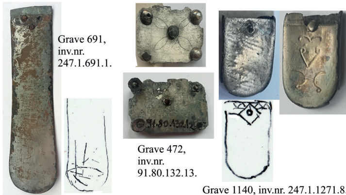
Grave 691, inv.nr. 247.1.691.1.