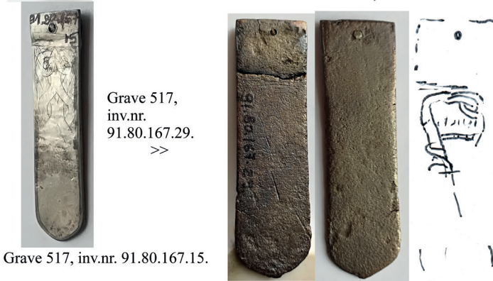
Grave 517, inv.nr. 91.80.167.29. >>