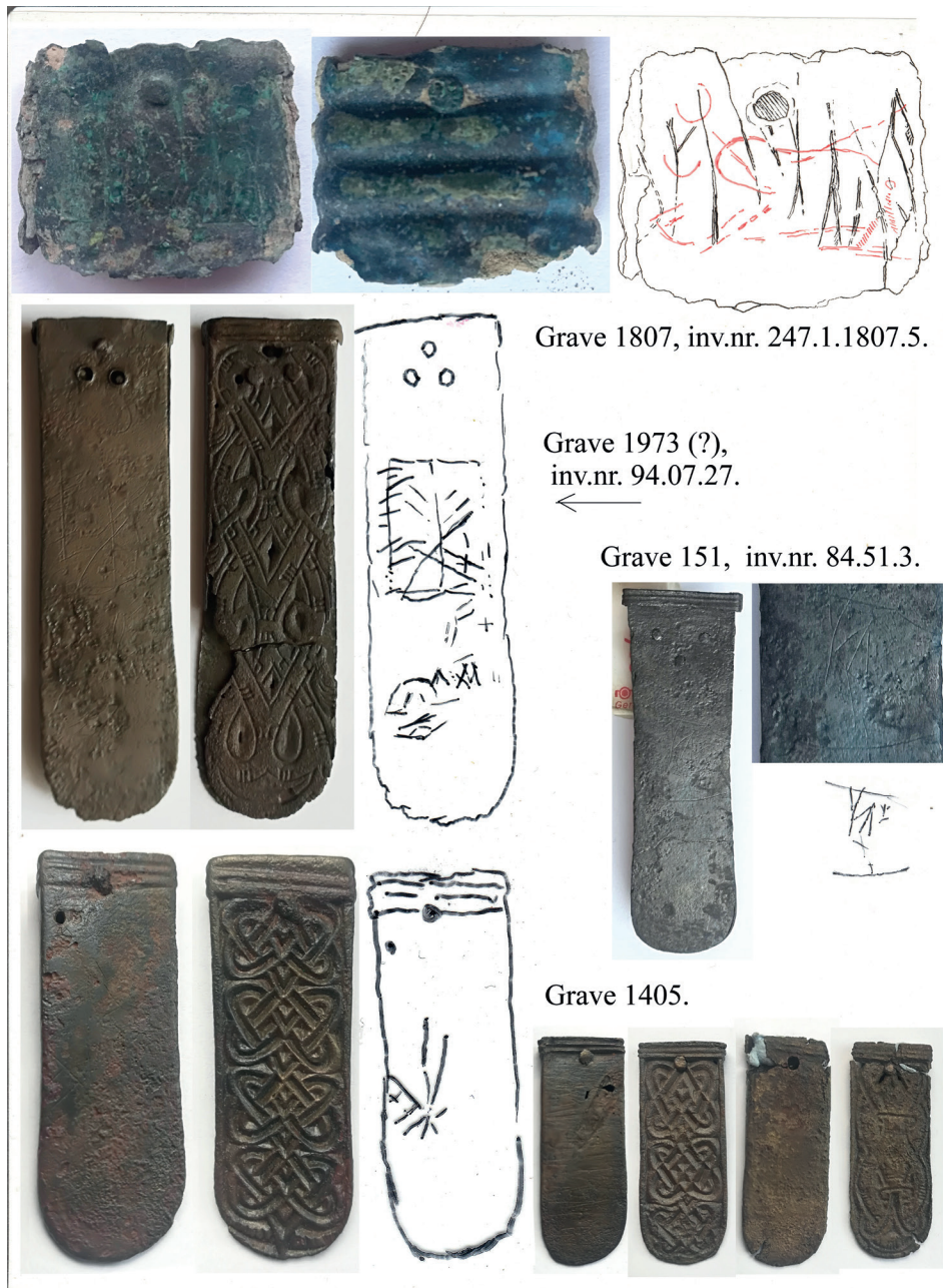
Grave 1807, inv.nr. 247.1.1807.5.

(all photos and drawings were taken by the author)