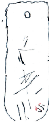
Grave 349, inv.nr. 84.184.27.