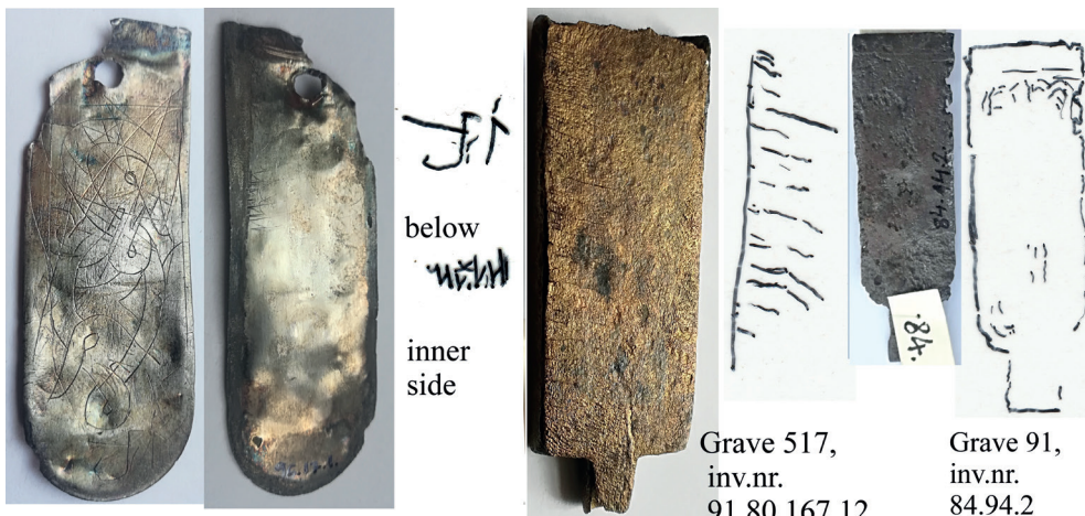
Grave 1425, inv.nr. 96.17.1.