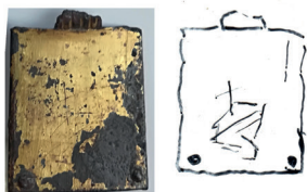
Grave 250, inv.nr. 84.114.29.