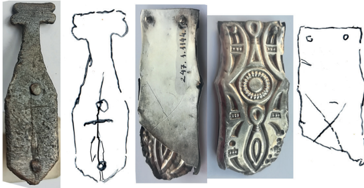
Grave 349, inv.nr. 84.184.19.