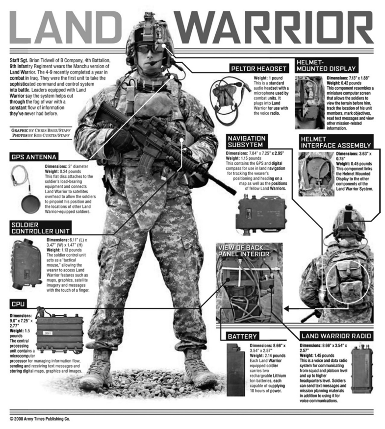
Picture 2. Complex control and communication system of land warrior. [5]

Similar to the theoretical structure of the presented (possible) digital soldier, the info-communication equipment of the samplers can be constructed to achieve continuous connection with the governing member of the sampling unit. With the help of the resulting system after the deployment and the starting of the sampling process, the governing person is in a continuous connection with the samplers, can coordinate their work, gives them instructions and gets a complete picture of the progress of the activity to ensure a successful operation. [6]