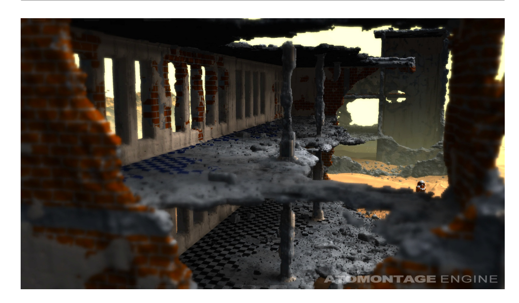
Figure 3. Ruined voxel building with modifiable environment. Excerpt from the Atomontage graphics engine demo

required for a polygon-based approach. The change in technology is unlikely to happen quickly. Modern game engines should also be prepared for voxel-based rendering, and even some hybrid rendering should be used during the transition period. The change in technology is unlikely to happen quickly. Modern game engines should also be prepared for voxel-based rendering, and even some hybrid rendering approach should be used during the transition period. In the history of computer games, there are already some that use a hybrid representation: for example, the game world used a normal polygon-based method, but other various game elements were implemented as voxels. In future solutions, the number of voxel elements and, of course, their quality may increase. Mainly targeting elements that have sufficient richness of detail, as these are the areas that are suitable for voxelation. Transforming a flat surface into a voxel model that does not have any surface characteristics is currently not worth it.