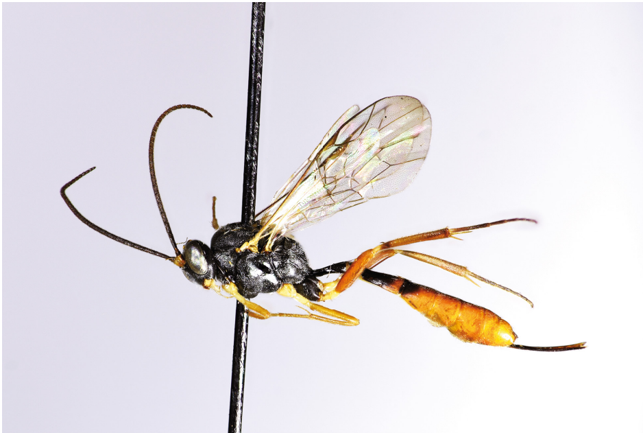
Fig. 3. Diadegma densepilosellum (Cameron, 1911), female

Material examined – Female, “South Africa, KwaZulu Natal, S Drakensberg, Garden Castle, under overhanging rocks, 21.829°44’59.4”, 29°12’42.1”, 1811m, 23.I.2007, leg. L. Papp & M. Földvári, No. 36”, specimen pinned, id. HNHM-HYM 155119. – Deposited in the HNHM.