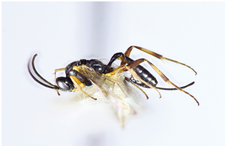
Fig. 5. Diadegma endrega sp. nov., holotype

Head : Antenna with 23 flagellomeres; first flagellomere moderately slender, 3× as long as its apical width; preapical flagellomeres subquadrate. Head transverse, matt, granulate, on lower face and clypeus with discernible punctures; hairs dense and moderately short, on lower face and clypeus longer. Ocular-ocellar distance 1.2× as long as ocellus diameter, distance between lateral ocelli 1.8× as long as ocellus diameter. Inner eye orbits slightly indented, parallel. Gena moderately short, roundly, relatively weakly narrowed behind eyes, in dorsal view 0.55× as long as eye width. Occipital carina complete, reaching hypostomal carina before base of mandible; hypostomal carina slightly elevated. Frons flat, impressed above toruli. Face and clypeus almost flat in profile, clypeus very weakly separated from face, relatively small, its apical margin convex, sharp. Malar space 0.7× as long as basal width of mandible. Lower margin of mandible with narrow flange from base towards teeth, flange obliquely narrowed at teeth; mandibular teeth about equal.