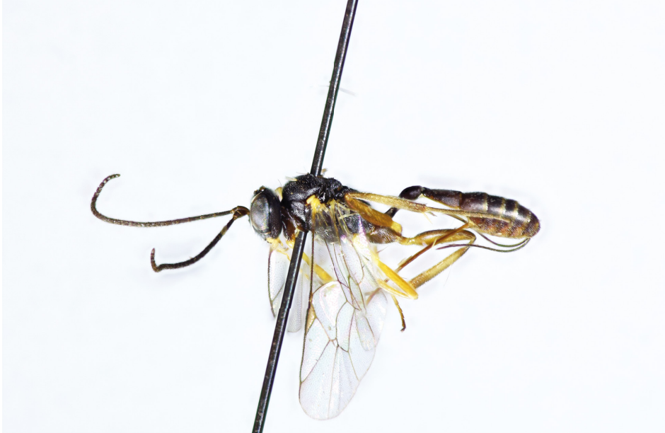
Fig. 1. Campoplex andariel sp. nov., holotype

Description – Female (Figs 1, 9). Body length ca. 5 mm, fore wing length ca. 3.5 mm.