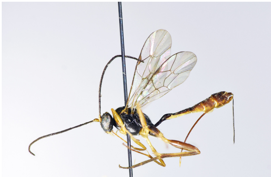
Fig. 2. Diadegma bruxa sp. nov., holotype

00172854, 00172858, respectively; three females, same locality and collectors, 2.II.1951, No. 166, specimens pinned, id. MZLU 00172871, 00172873, 00172876; one male, same locality and collectors, 14.II.1951, No. 183, specimen pinned, id. MZLU 00172868. – Holotype and paratypes are deposited in the MZLU, except three paratypes (two females and one male, id. MZLU 00172859, 00172876, 00172858, respectively) are deposited in the HNHM (as id. HNHM-HYM 155152–155154).