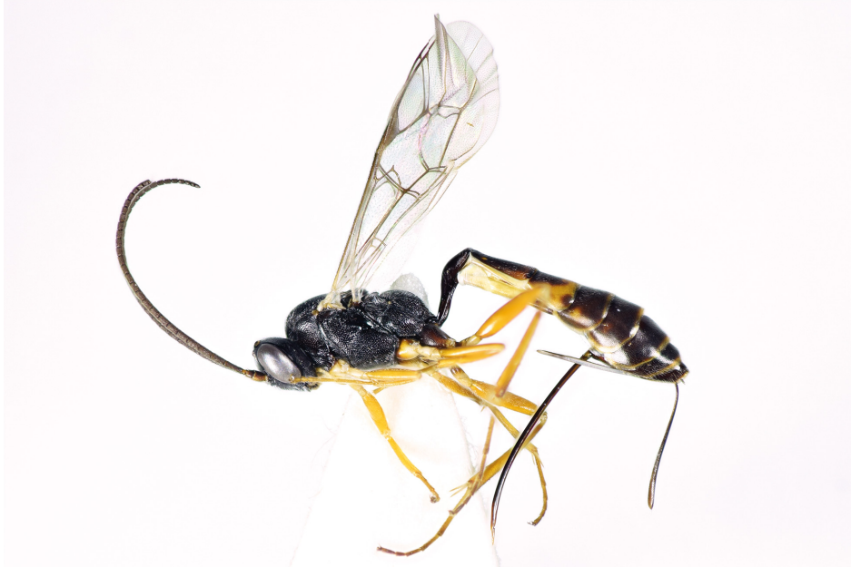
Fig. 6. Diadegma katarakan sp. nov., holotype

pedicellus ventrally yellowish brown; head and mesosoma black, palpi, mandible and tegula yellow; metasoma black to dark brown, second tergite subapically reddish brown, third tergite posteriorly and laterally orange, fourth tergite laterally with an orange-brown spot, and posterior margins from fourth tergite onwards very narrowly yellowish; fore and middle coxae predominantly yellow, hind coxa dark; hind femur orange; hind tibia orange with weak banded pattern, subbasally and apically brownish, basally and externo-medially yellowish.