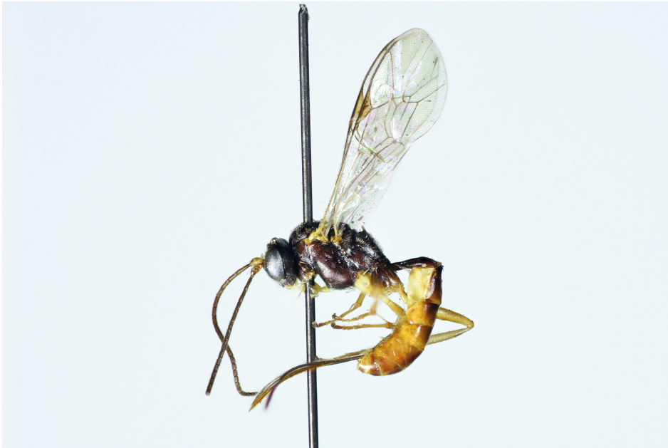
Fig. 4. Diadegma ekimmaria sp. nov., holotype

dorsally brown; head and mesosoma blackish, tinged with dark brown, palpi, mandible and tegula yellow, apical margin of clypeus reddish brown; first metasomal tergite blackish, second tergite blackish to brown, posterior margin yellowish, third and following tergites brownish, more or less extensively orange-brown, posterior margins more or less yellowish; fore and middle coxae entirely yellow, hind coxa dark brown; hind femur orange, dorsally slightly darker; hind tibia pale yellowish, subbasally and apically brownish, its banded pattern weak but discernible.