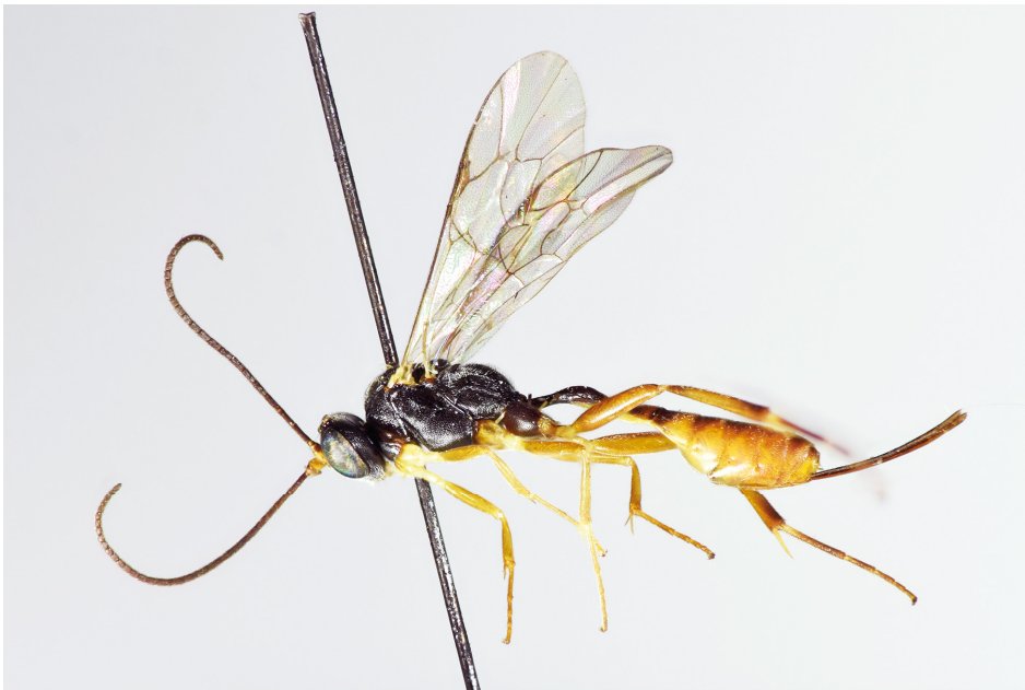
Fig. 8. Diadegma striga sp. nov., holotype

Diagnosis – The new species can be easily identified among the Afrotropical species of Diadegma by the following character states in combination: gena short, strongly narrowed behind eyes; occipital carina complete; propodeal carination partly reduced, lateromedian longitudinal carinae behind anterior transverse carina absent, posterior transverse carina absent between lateral longitudinal carinae; areolet very shortly petiolate, quadrate, 2m-cu distinctly distal to its middle; nervulus weakly postfurcal; second tergite 1.5× as long as wide; posterior margins of sixth and seventh tergites medially about straight; ovipositor sheath 1.25–1.35× as long as hind tibia; scapus and pedicellus ventrally yellow, dorsally brown; head and mesosoma black, palpi, mandible and tegula yellow; first metasomal tergite black, following tergites dorsally dark brown with orange-brown posterior margins, laterally orange; fore and middle coxae entirely yellow, hind coxa blackish to dark brown; hind femur orange; hind tibia orange, subbasally and apically brownish, its banded pattern weak but discernible.