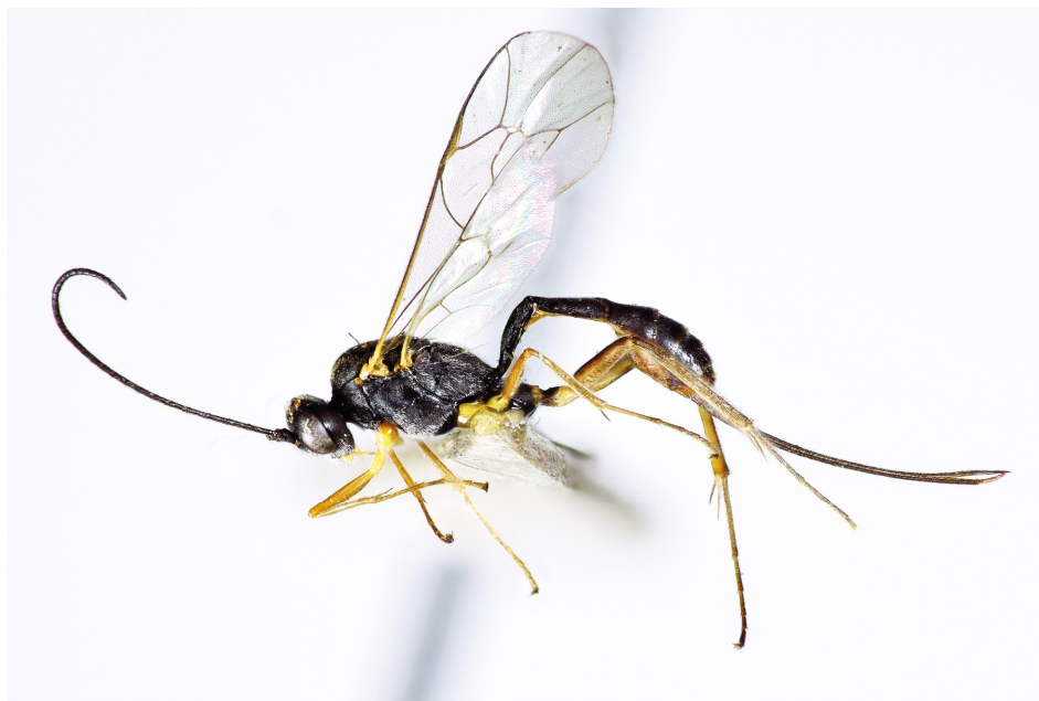
Fig. 7. Diadegma kikimora sp. nov., holotype

Diagnosis – The new species can be easily identified among the Afrotropical species of Diadegma by the following character states in combination: gena moderately long, in female distinctly, in male weakly narrowed behind eyes; occipital carina complete; propodeal carinae entirely absent; areolet petiolate, roughly triangular, 2m-cu at its distal corner; nervulus postfurcal; second tergite 1.5–1.8× as long as wide; posterior margin of sixth tergite medially straight, posterior margin of seventh tergite medially slightly concave in female; ovipositor sheath 2.3–2.5× as long as hind tibia; scapus and pedicellus black; body black, palpi, mandible and tegula yellowish, posterior margin of third tergite ventrolaterally, and laterotergites from fourth tergite onwards ventrally reddish brown; fore and middle coxae yellowish, hind coxa black; hind femur brownish orange, dorsally brownish; hind tibia brownish orange, basally and apically slightly darkened.