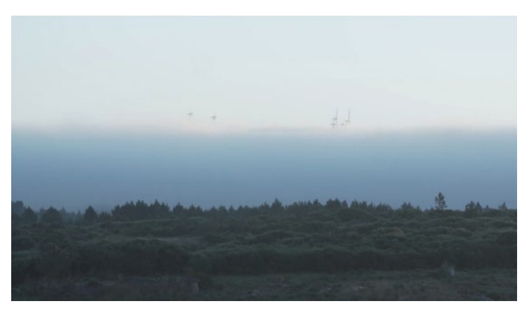
FIGURE 1. Stills from the prologue of Displacement.

This prologue introduces the audience to the space and time of Displacement (Nogueira 2021), a twenty-minute documentary film, framed by Landscape Cinema aesthetics,<sup>3</sup> that portrays a family living in northern Portugal who are forced to move due to the construction of a dam