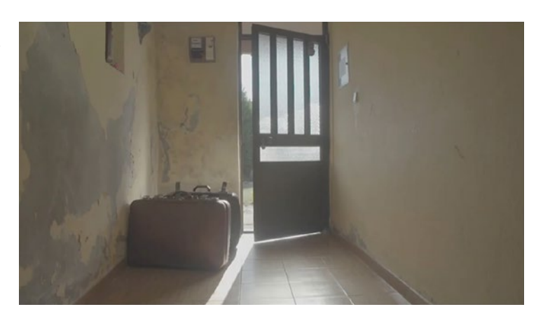
FIGURE 4. Stills from the third chapter of Displacement.