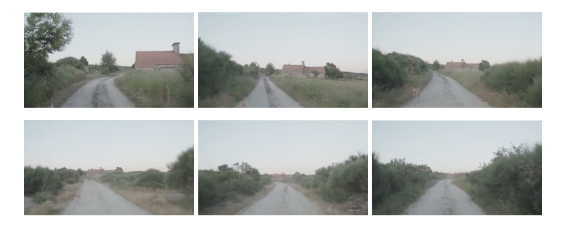
FIGURE 3. Sequence shot of the family moving, Displacement.

If, at first sight, the documentary seems to portray a nostalgic romantic vision of the rural countryside, we soon become aware that the film's subject is far from the picturesque. The sound of the radio news announces the construction of ten new dams, under the "Portuguese National Programme for Dams with High Hydropower Potential," forcing several families to move. Progressively, and while the family proceeds with their daily activities, moving within the house and in its surroundings, the camera begins to frame the subjects as fragments, and the imagery shows human body parts, glimpses behind doors, or reflections on different surfaces. As the sun goes down, a travelling sequence shot embodies the action of the family moving in twilight, leaving behind the house they had lived in for three generations (fig. 3).