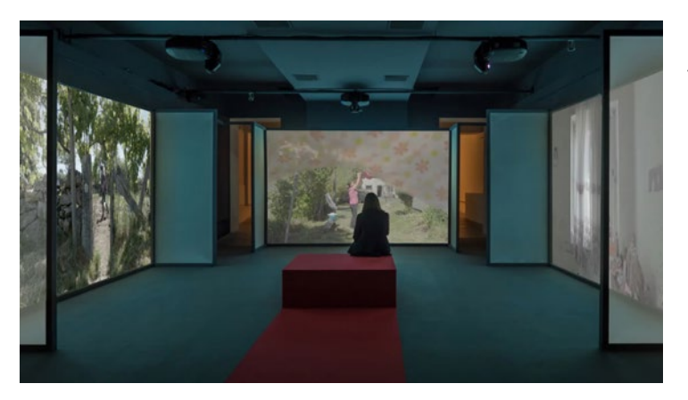
FIGURE 6. Installation plan for Displacement.

poses a hybrid figure of the observer, a kind of mixture between the museum visitor and the movie theatre spectator, by introducing the notion of "temps exposé," a time which embodies a new existence of cinema, which nevertheless itself becomes what Royoux (2000) terms "cinéma d'exposition."