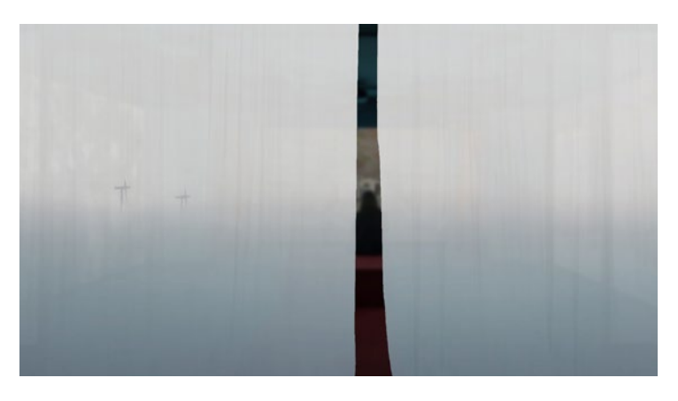
FIGURE 5. The darkroom's entrance, with the prologue images projected on translucent plastic. Installation plan for the 2020 Cerveira International Art Biennial (cancelled due to the Covid-19 pandemic).

There is a piece of white translucent plastic floating in front of me. It partially veils the dark room, where one can make out a projection, and partially allows moving images to be seen projected on its surface (fig. 5). On the plastic, wide angle shots show the morning mist over the river, thick clouds slowly hiding the wind turbines, the morning sunlight illuminating a house located in the fields. Landscapes, nature, objects, compositional lines, skylines... the contours are always concealed by the fogginess of the early morning dusk. The spatial and atmospheric images of the prologue are made even more ungraspable by the projection onto semi-opaque material, which enhances the evanescent properties of the landscape, diluting the screen and the images, and the distinction of reality and its representation. Furthermore, the gauzy, malleable, and wavy surface on which these images are projected emphasises the diffused imagery that cannot be fully grasped through sight, but can only be sensed through an ethereal experience, dragging the spectator to an oneiric, semi-imaginary diegesis. The images seem to escape our ability to see and seem to overflow the limits of the projected area, surpassing the plastic while the material flows.