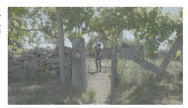
FIGURE 2. Stills from the first chapter of Displacement.

that will soon submerge their home. After the prologue, which depicts the surrounding landscape, the camera moves closer to the house and begins to capture the unfolding of daily activities. Through static, long shots, the documentary portrays a family—a mother, a father, and two daughters—in their domestic space and farming the fields nearby