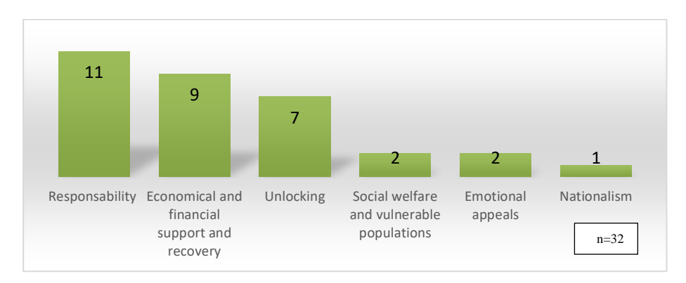
Figure 2. Thematic categories mentioned in António Costa's tweets (n<sup>1</sup>)

The substance of António Costa's tweets mainly comprised mentions of the following thematic categories: responsibility (11 tweets; 34.4%), economic and financial support and recovery (9 tweets; 28.1%), unlocking (7 tweets; 21.9%). Less frequent mentions were also made of social welfare and vulnerable populations (2 tweets; 6.3%), emotional appeals (2 tweets; 6.3%), and nationalism (1 tweet; 3.1%). These results are presented graphically in Figure 2.