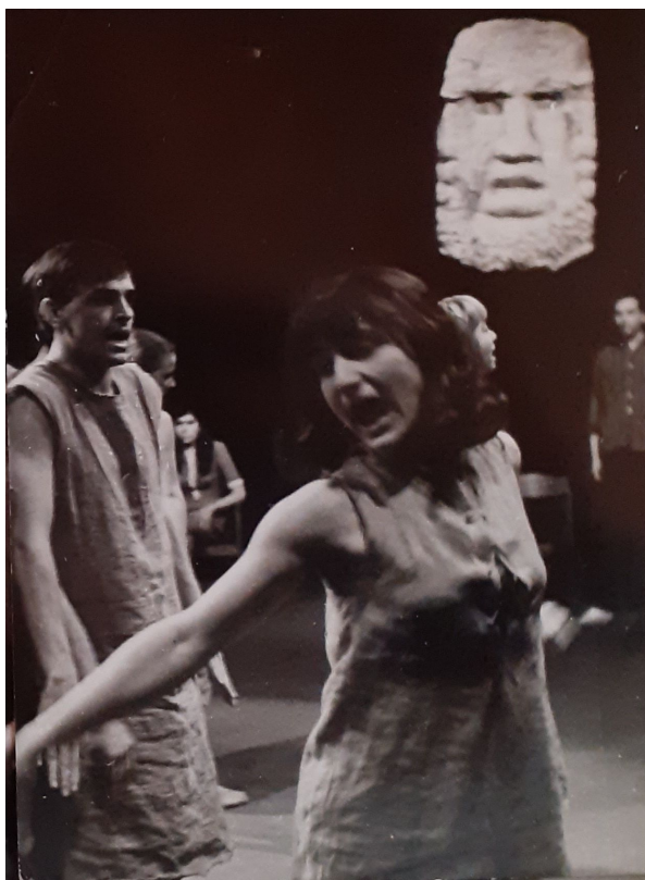
FIG. 4. Scene from Theomachia .