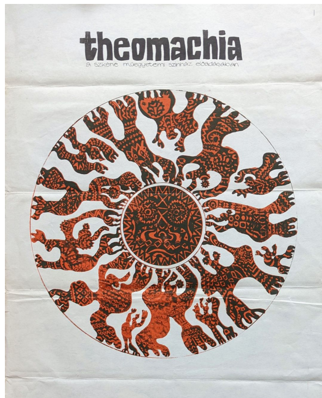
FIG. 5. Playbill of Theomachia , 1970.