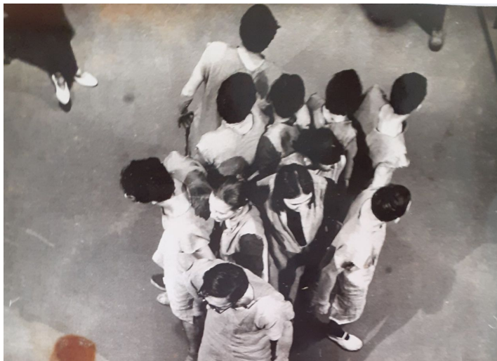
FIG. 6. Choreography of the Choir. Rehearsals of Theomachia .