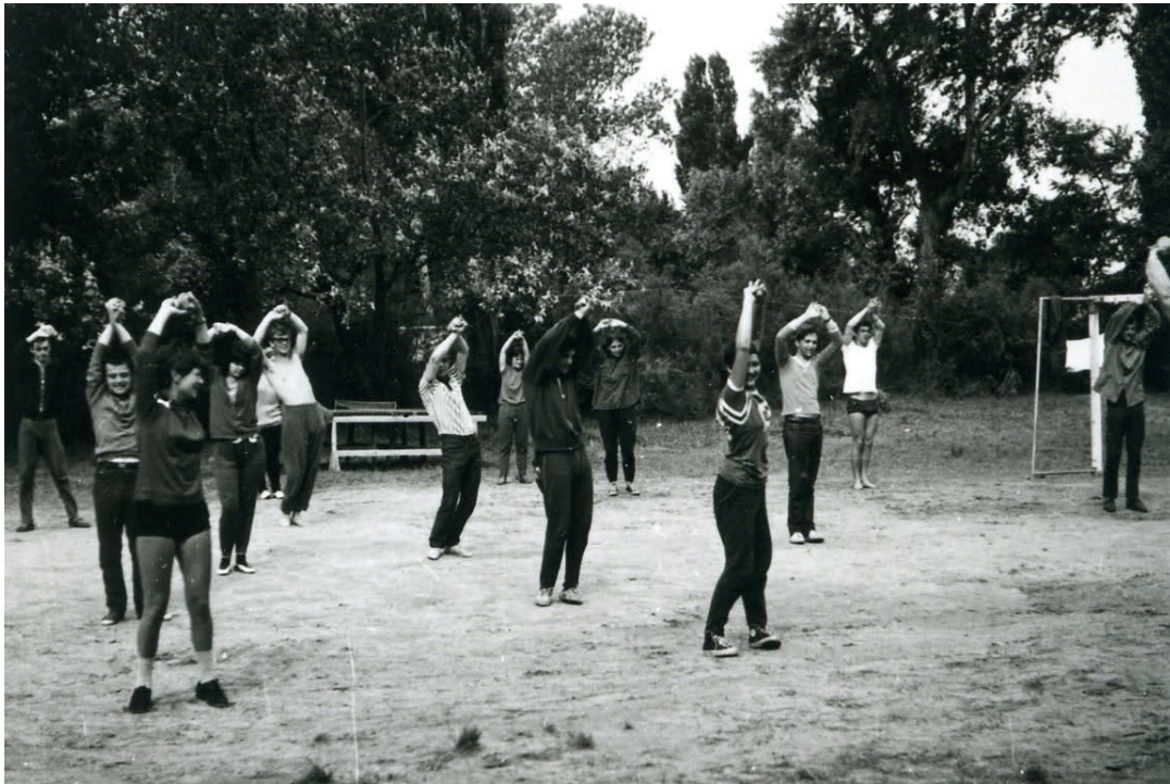
FIG. 3. Morning gymnastics at the summer camp in Balatonlelle.