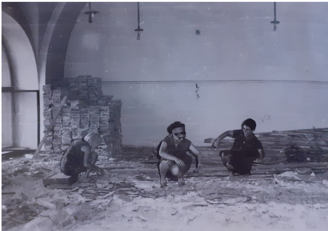
FIG. 1. Members of the collective that helped to build the Szkéné Theatre.