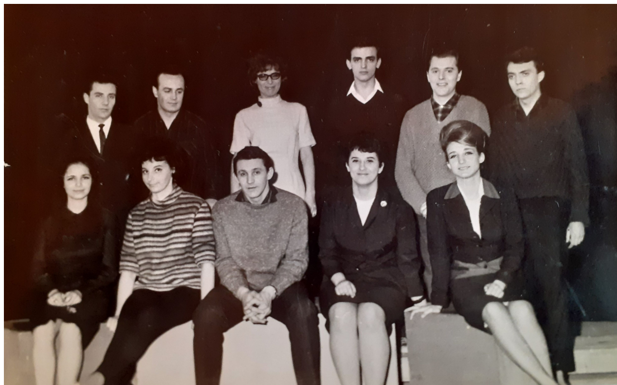
FIG. 2. Collective of BME Literary Stage in 1965.