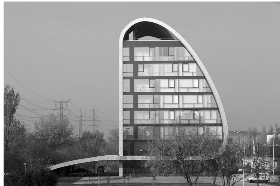
Autoklub headquarters, Budapest, Lukács and Vikár, 2011

practice. One of the distinctive groups consists of narrative strategies that try to present a natural and formal prefiguration, and are based on preconceptions from outside of architecture in a certain sense. The second one contains abstract concepts based on some kind of regularity; and finally, the third is the group of concepts reflecting on the inner and outer contexts of architecture. Several transitional passages establish a coherent network between all these methods and experiments. At the same time, the endpoints of this network create an interpretive scope broad enough to render it suitable for analyzing the most recent architectural efforts. The examples I have selected are predominantly public buildings. The reason for this choice – beyond the greater freedom of formation and conception allowed by the size – is undoubtedly this genre's natural relationship with architectural representation, which broadens the